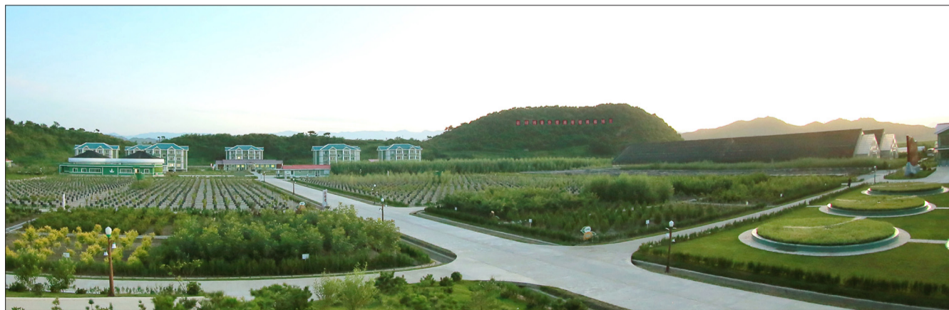
The Kangwon Provincial Tree Nursery produces more than 20 million tree saplings a year.

As he inspected windy ports and wharves again and again, new bywords were coined one after another, including the socialist fragrance of the sea, "spectacular scenery of big fish catch", "fishing vessels of Tanphung series", a fishermen's village with the fishing vessels of Tanphung series, fisherman of fishing vessels of Tanphung series and fishing legend.