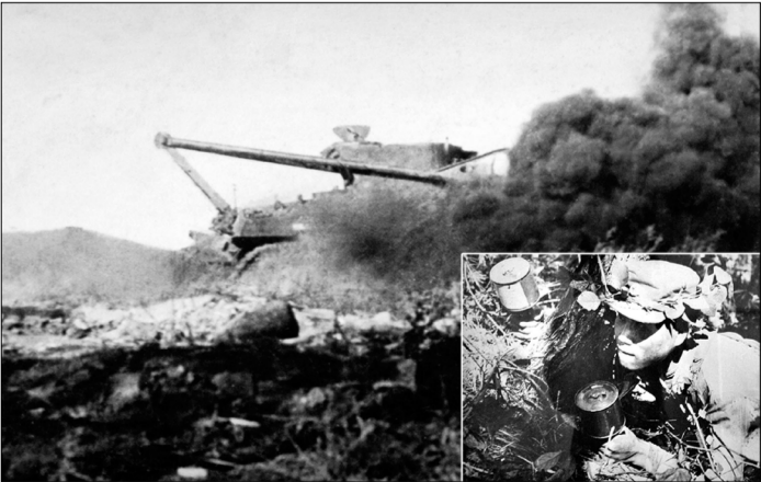
File photos show women service personnel in the anti-aircraft team movement (left) and a KPA soldier in the tank hunting team movement.