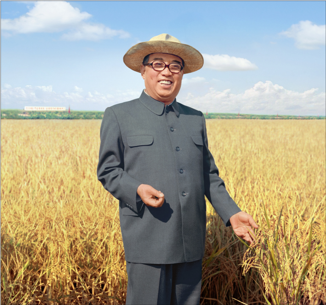
President Kim Il Sung on a field inspection of the Samjigang Cooperative Farm in Jaeryong County in September 1976.