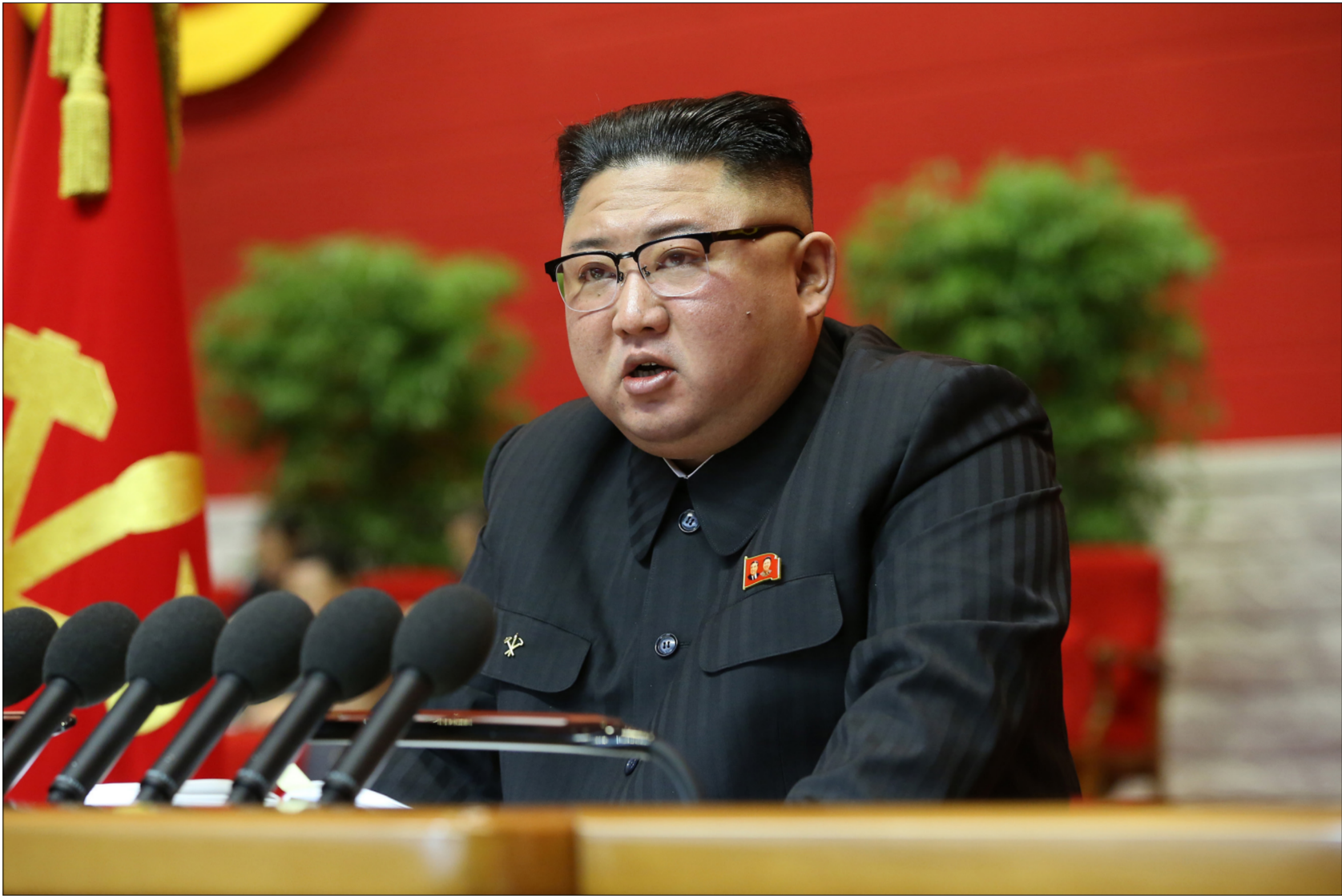
Kim Jong Un delivers the report on the work of the Seventh Central Committee of the Workers’ Party of Korea at the Eighth WPK Congress in January 2021.

In his work Making Selfless, Devoted Efforts for the Good of the People Is the Mode of Existence and Source of Invincible Might of the Workers’ Party of Korea published in October 2015, he said that the great Kimilsungism-Kimjongilism is, in essence, the people-first principle and making selfless, devoted efforts for the good of the people is the mode of existence of our Party. He also noted that our Party would continue to write the sacred history of the people-first principle forever, true to the noble