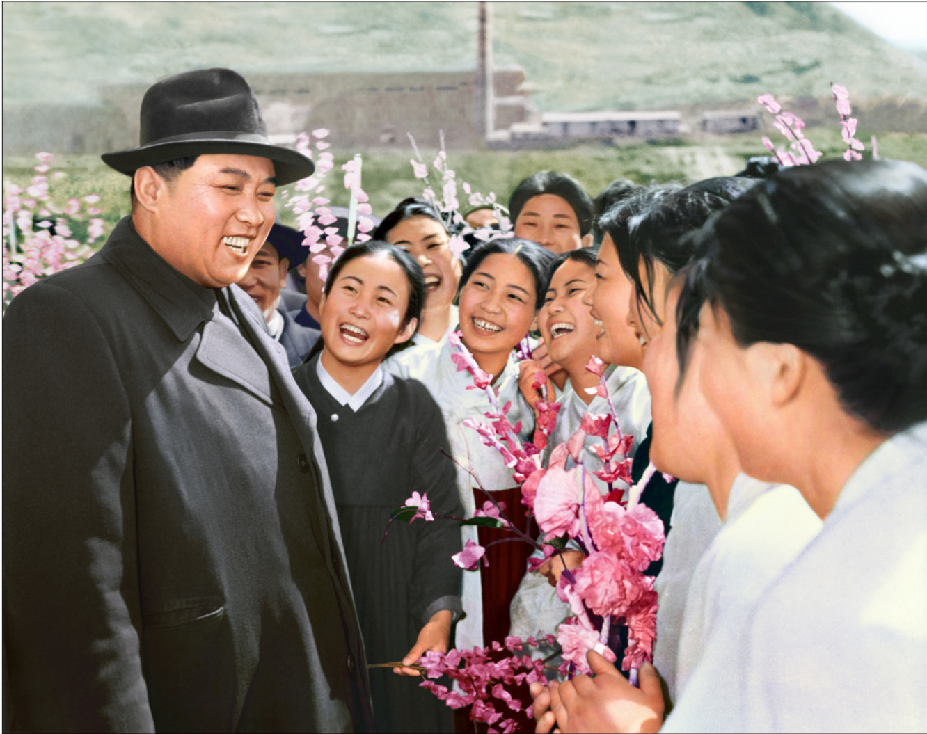
President Kim Il Sung among women workers in April 1961.

On his visits to factories, cooperative farms, construction sites and scientific research institutes, he met with workers, farmers, scientists and technicians at their workplaces and