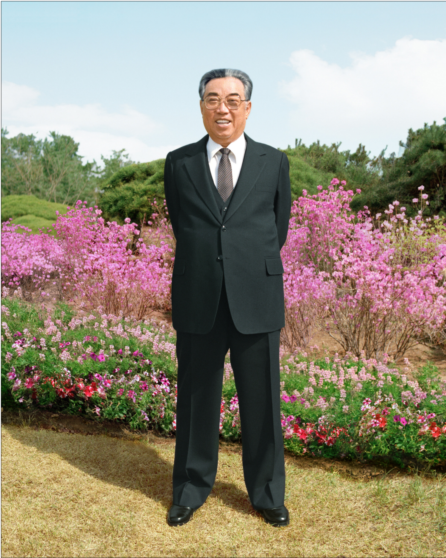
President Kim Il Sung in April 1988.

The imperialists brought the dark clouds of war to nip the fledgling DPRK in the bud, regarding it as a thorn in their flesh, but under his leadership the Korean people resolutely repulsed the aggressors to defend the country's independence and sovereignty, proudly demonstrated the might of the heroic people, who had won victory in the war, in the post-war rehabilitation and turned out for the building of a rich and powerful socialist