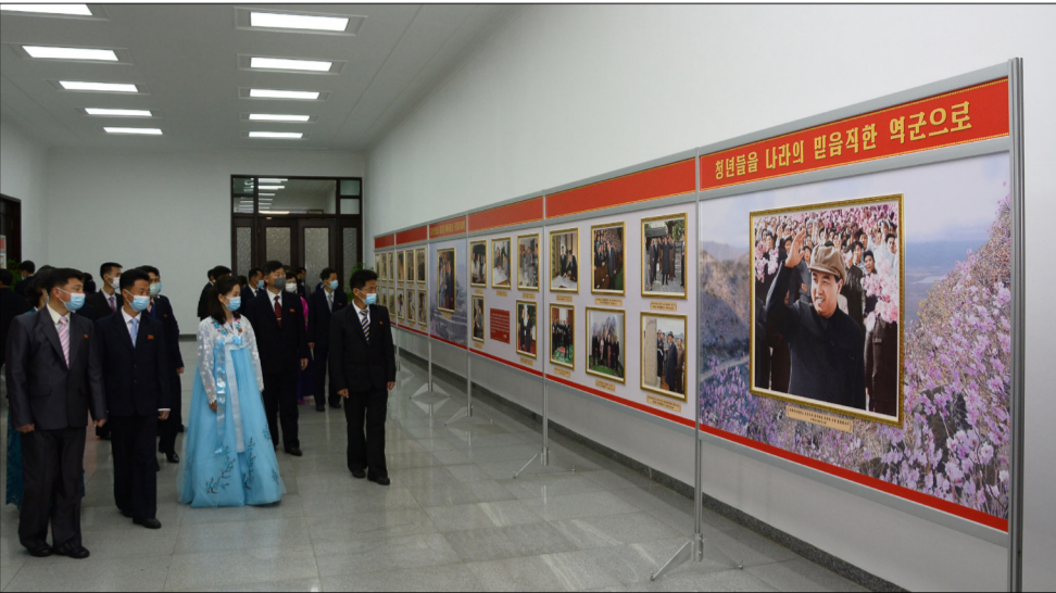
Pyongyang citizens look round the national photo exhibition in celebration of the 110th birth anniversary of President Kim Il Sung.