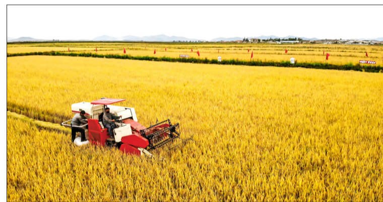
A bumper harvest of rice is gathered in.

In his letter to the participants in the national conference of sub-workteam leaders in the agricultural sector he said that the