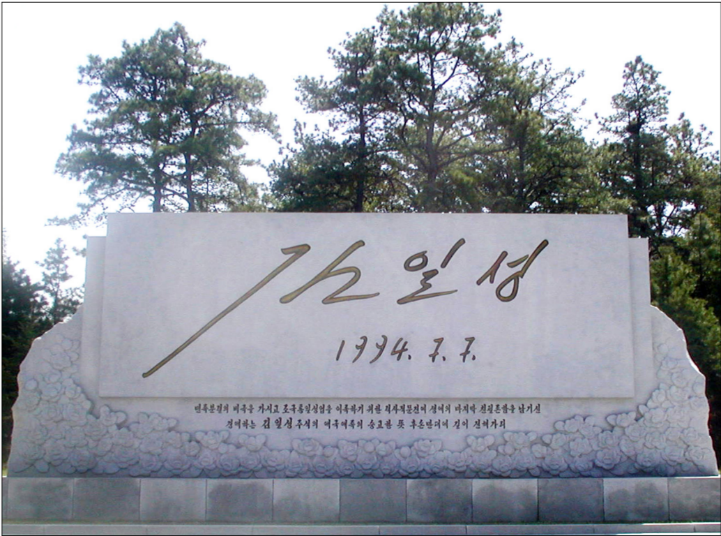
Monument inscribed with President Kim Il Sung’s signature on a historic document for Korea’s reunification. He put the signature just a day before his demise.

The Korean people erected a monument inscribed with this signature at Panmunjom in order to hand down to posterity the exploits of the President who had devoted himself to national reunification until the last moment of his life since national division.