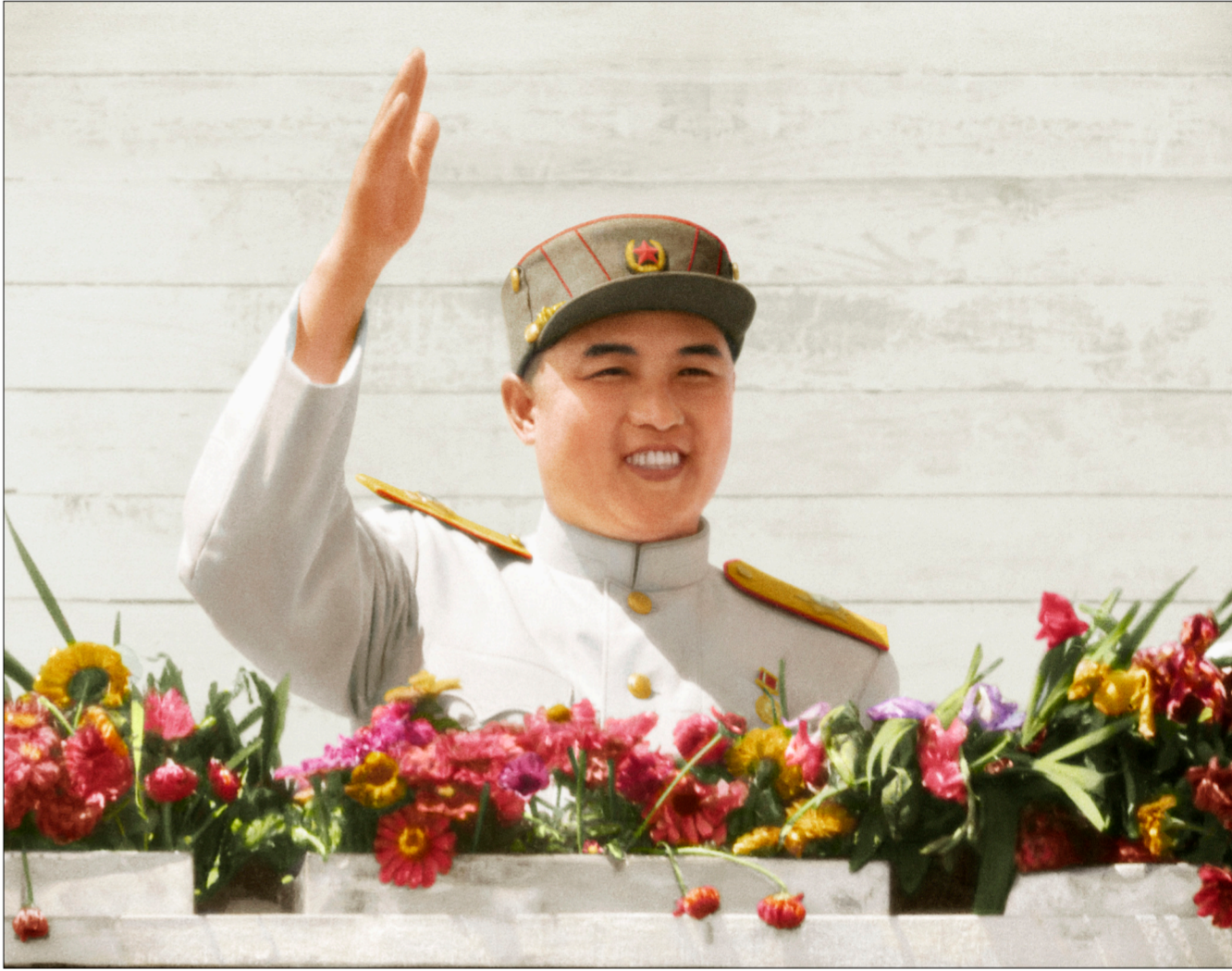
Supreme Commander Kim Il Sung acknowledges cheering crowds and service personnel of the Korean People's Army in August 1953.

After the beginning of the war, he made sure that the