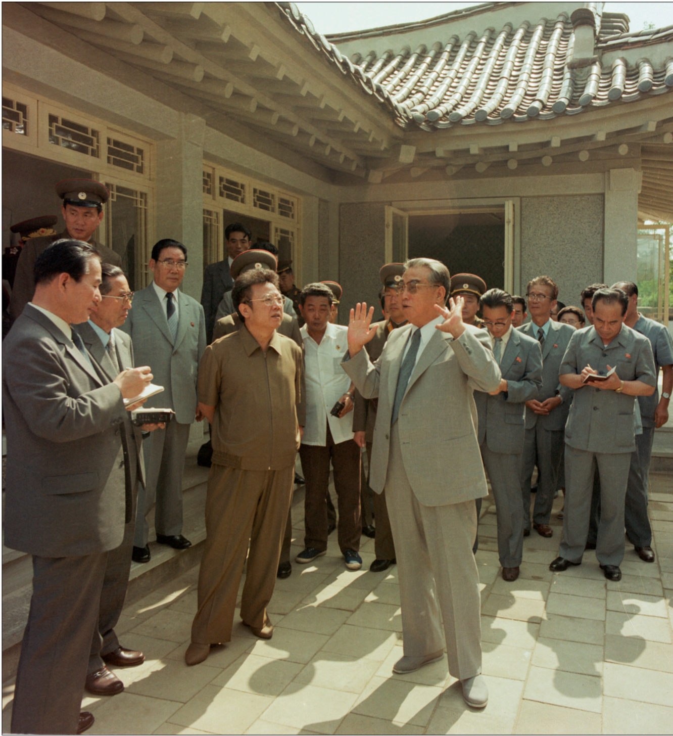
President Kim Il Sung and Chairman Kim Jong Il look around newly-built Korean style dwelling houses in Namri village in August 1985.

He also ensured that the acreage of farmland was increased by waging a vigorous movement for reclaiming tideland and bringing new land under the plough and grain production continuously increased by putting breeding and cultivation methods of agricultural crops on a scientific basis, while increasing the state investment in the rural economy and accelerating the rural technological revolution. At the same time, he took appropriate steps to develop livestock,