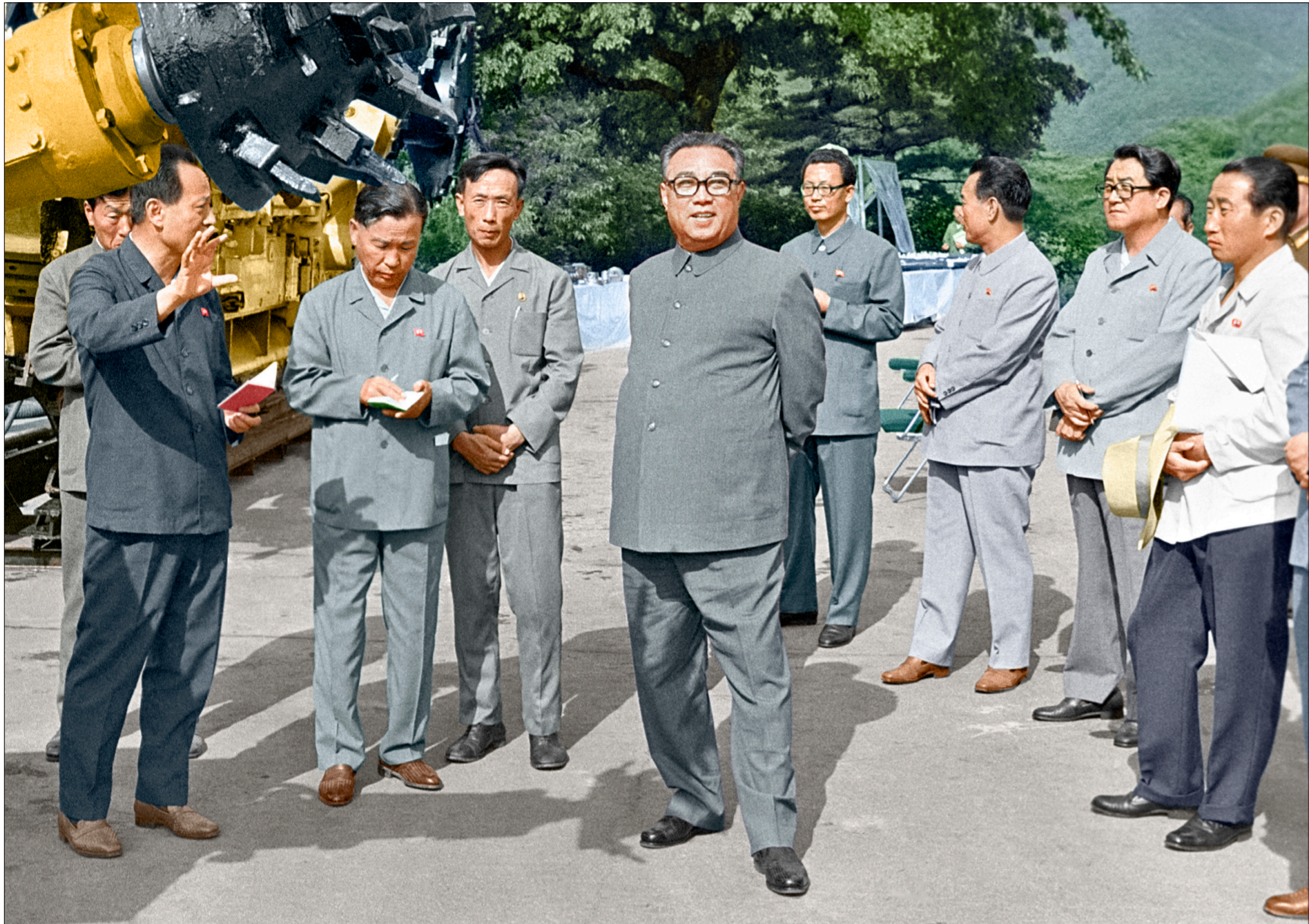
President Kim Il Sung sees a coal cutter produced at the May 10 Factory in July 1980.