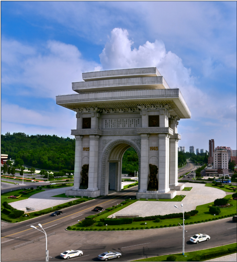
The Arch of Triumph at the foot of Moran Hill in Pyongyang.