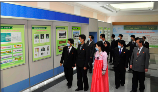
Visitors show interest in the exhibits at the national industrial design exhibition in celebration of the Day of the Sun.