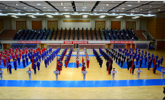
The opening ceremony of the Mangyongdae Prize Games in celebration of the Day of the Sun takes place on Pyongyang's Chongchun Street.

He stressed the need for players and coaches to make good achievements by giving full play to sports techniques practised in ordinary days, noble sportsmanship and fair play, organizing ability and the might of unity of the collective and actively applying the advantageous