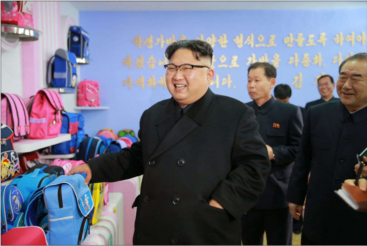
The respected Comrade Kim Jong Un inspects newly-built Pyongyang Bag Factory in January 2017.

Models and standards of the Juche-oriented architecture are being created constantly under the wise leadership of the General Secretary.