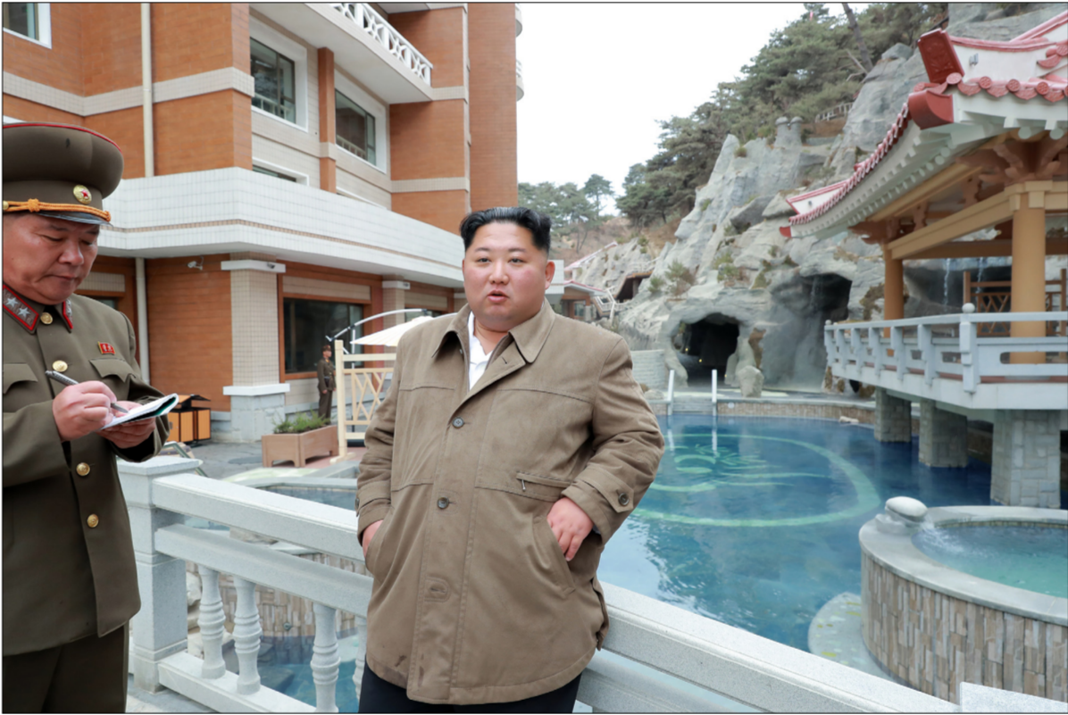
Providing field guidance at the construction site of the Yangdok Hot Spring Resort in November 2019.