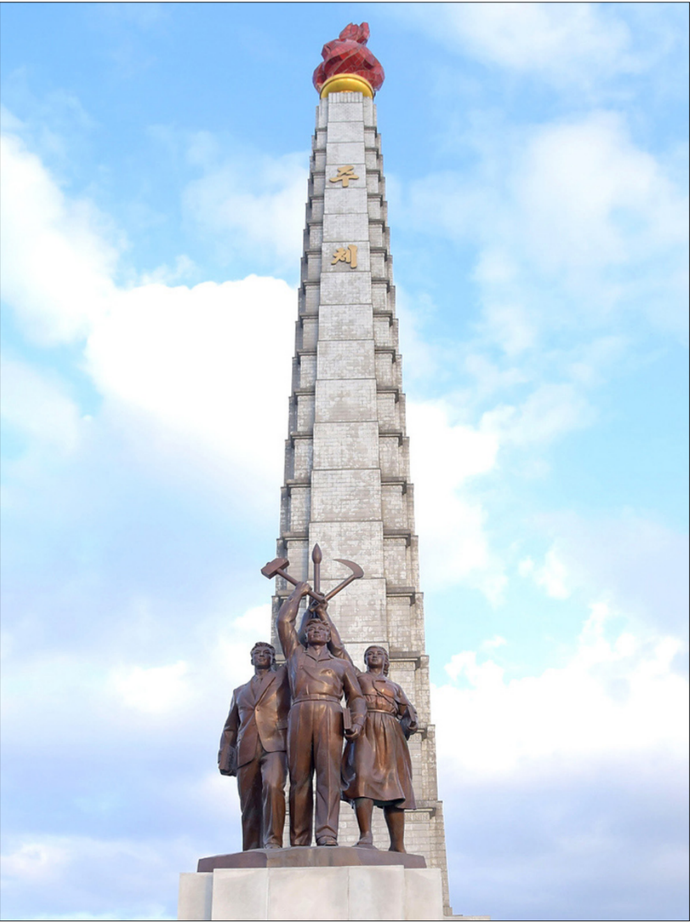
The Tower of the Juche Idea stands on the banks of the Taedong River.

The torch on the body is made of red-coloured glass and it seems to burn even at night as it is installed with a special illuminator.