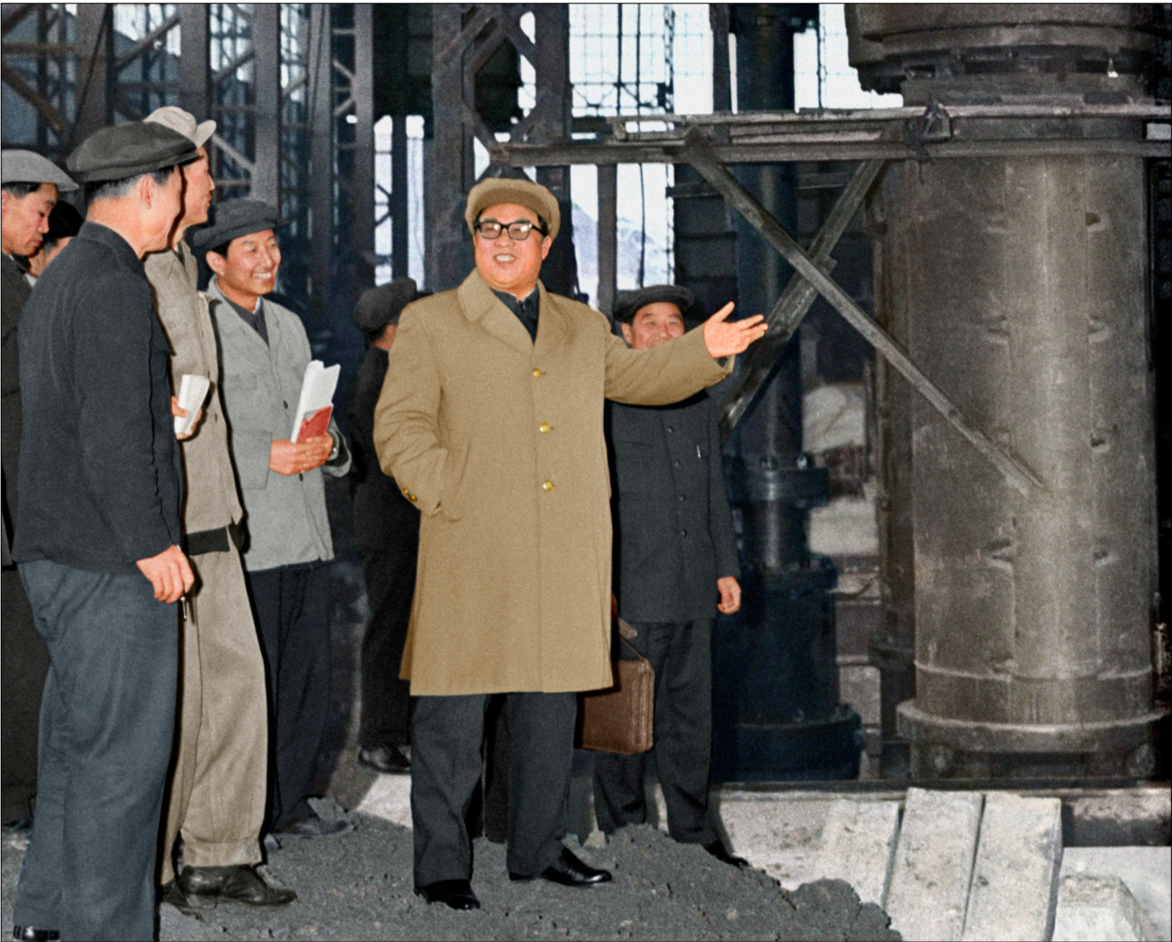
President Kim Il Sung is pleased to see the 6 000-ton press made by the working people of the then Ryongsong Machine Factory at the then Kangson Steel Works in April 1969.