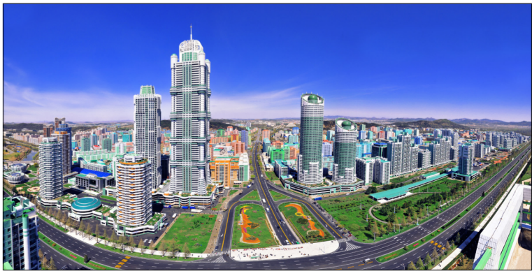
A panoramic view of Ryomyong Street.

As seen above, each day of the past decade bears the footprints of the General Secretary who continued energetic revolutionary activities of devotion to the people.