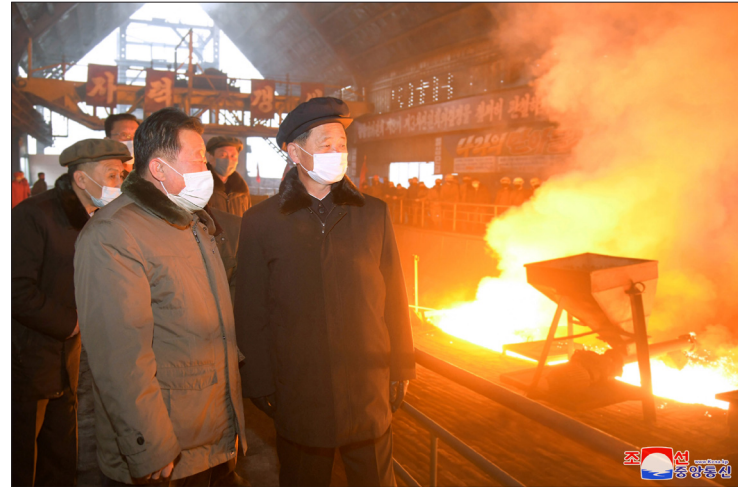
Premier Kim Tok Hun (first from right) looks round the Hwanghae Iron and Steel Complex.

The field consultative meetings discussed the issues of firmly cementing material and technical foundations for increasing iron and steel production, producing and supplying enough fertilizer needed for next year's farming, improving the quality of insulating materials and increasing the ranks of technicians and skilled workers and expanding the production capacity.