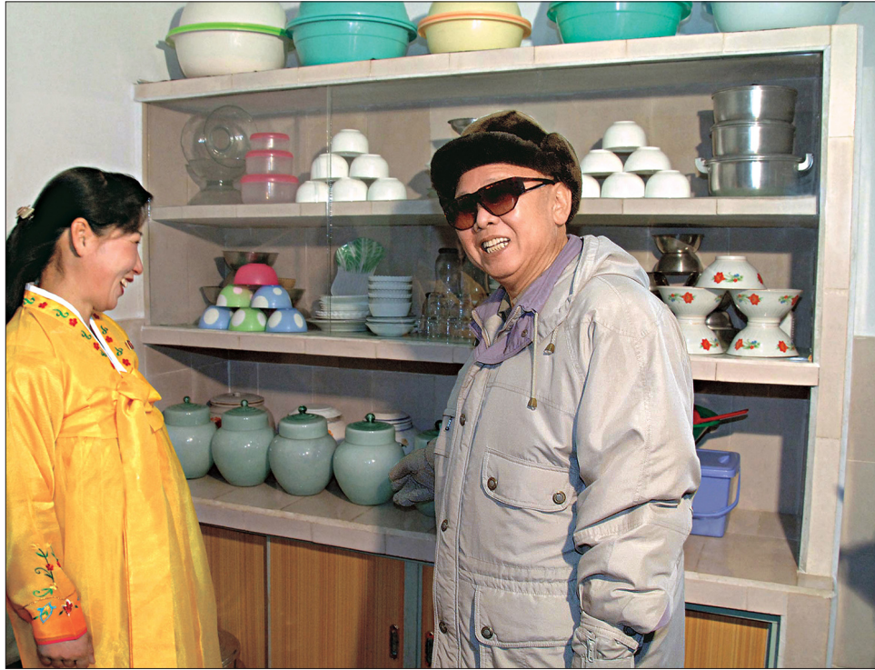
On a visit to a discharged soldier couple who moved into a new house in January 2009.