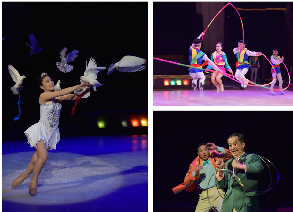
HONG KWANG NAM / THE PYONGYANG TIMES