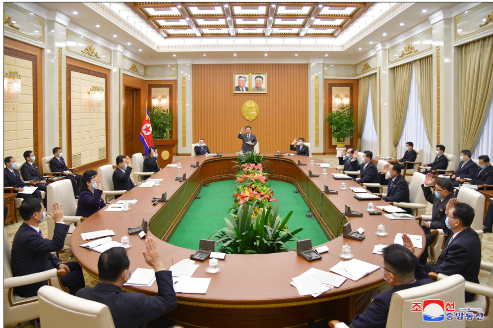
The 18th Plenary Meeting of the 14th Standing Committee of the Supreme People's Assembly of the DPRK is held at the Mansudae Assembly Hall in Pyongyang.

First, a decision of the SPA Standing Committee on convening the Sixth Session