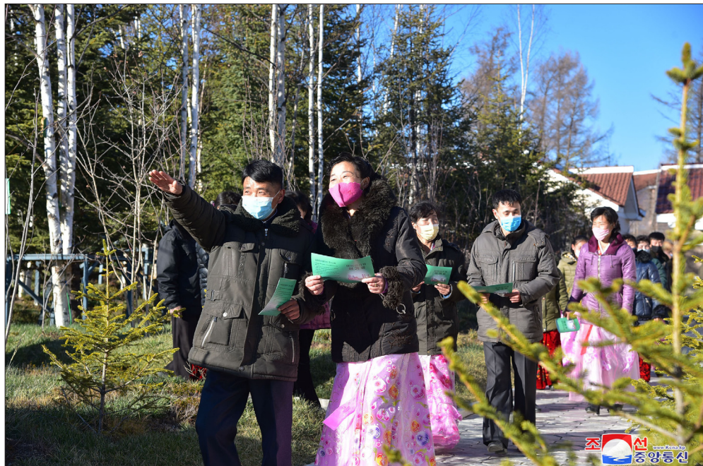
Top: Dairy products and nourishing foods are regularly supplied to children. Above: Working people take great delight in receiving new houses gratis.

The measures taken by the WPK for the people invariably in the past and present offer great encouragement to the Korean people who are now out for implementing the five-year plan.