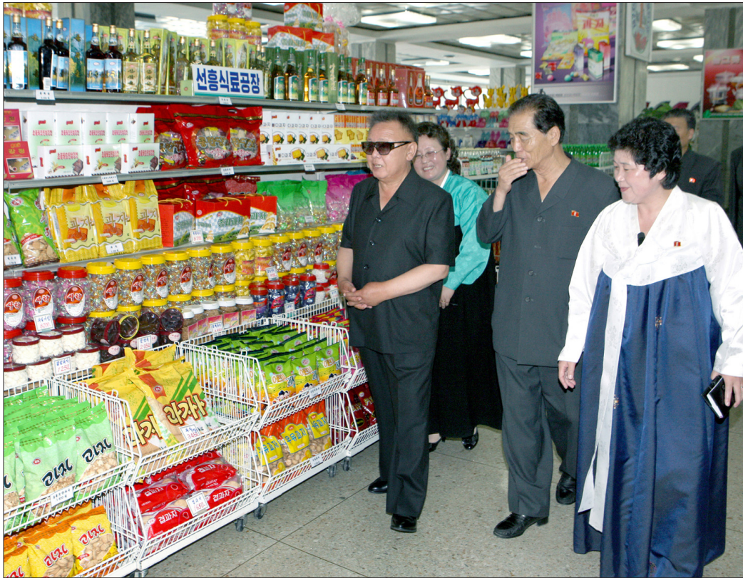
Looking round the commodity exhibition at Pyongyang Department Store No. 1 in July 2011.