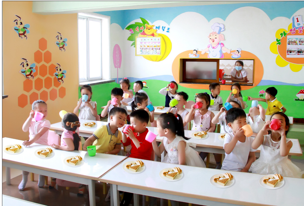
HONG KWANG NAM / THE PYONGYANG TIMES