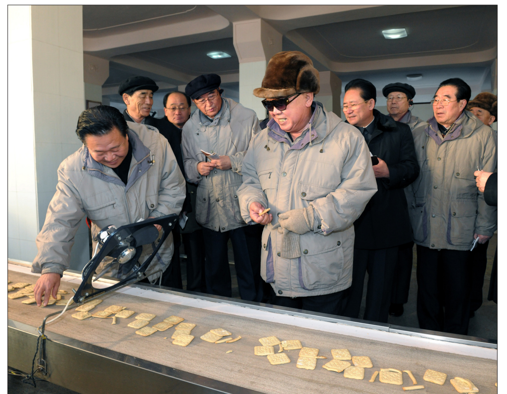
On a visit to the Jongbangsan General Foodstuff Factory in January 2011.