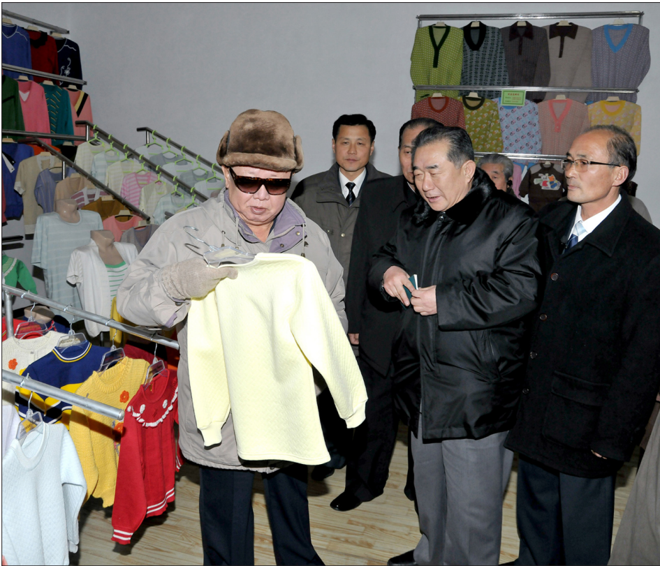
At the Hamhung Knitwear Factory in December 2011.