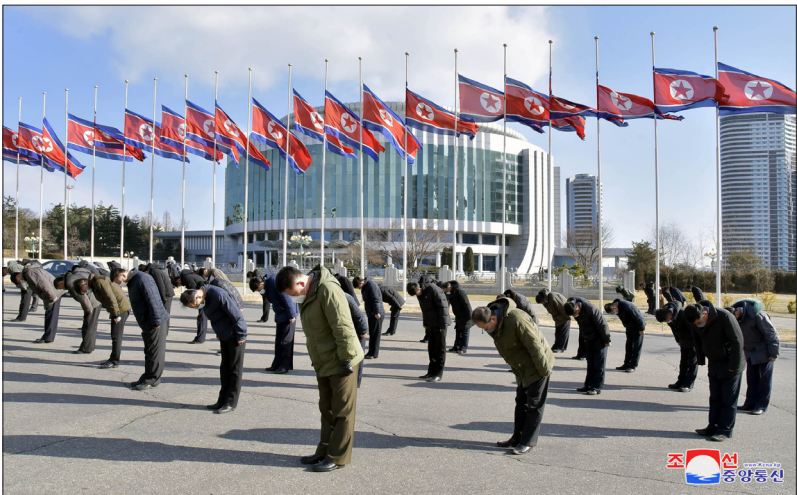
The Korean people observe three minutes' silence in memory of Chairman Kim Jong Il.