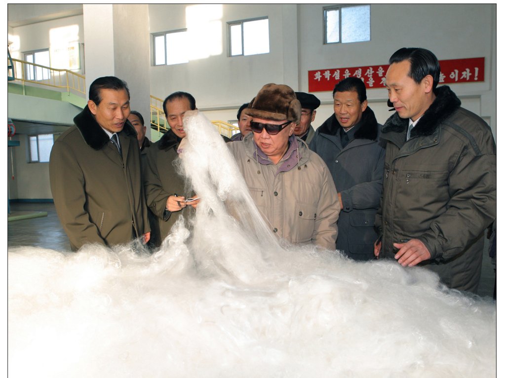
Examining vinalon cotton at the February 8 Vinalon Complex in January 2011.

The Korean people enjoy tangible benefits of his politics of love and trust, the politics of making devoted, selfless efforts for the good of the people, paying primary attention to their life and taking warm care of all people everywhere at all times and under any conditions and environment, and under his loving care they redouble their efforts to fulfill the desire of the Chairman to build a powerful country.