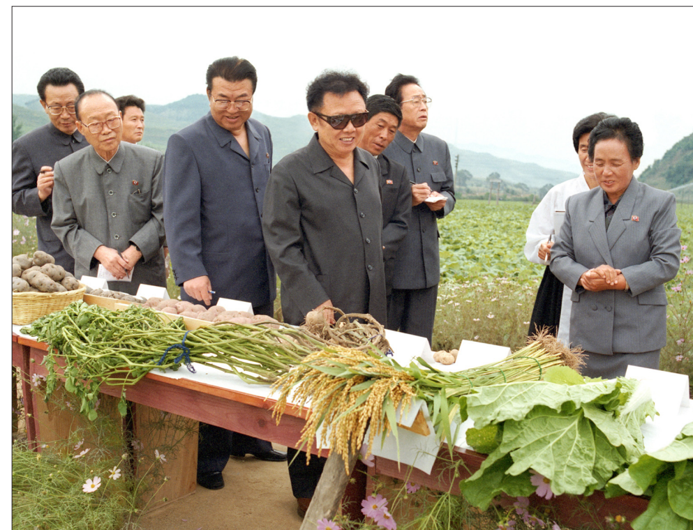
On the Township Cooperative Farm in Janggang County in September 1999.