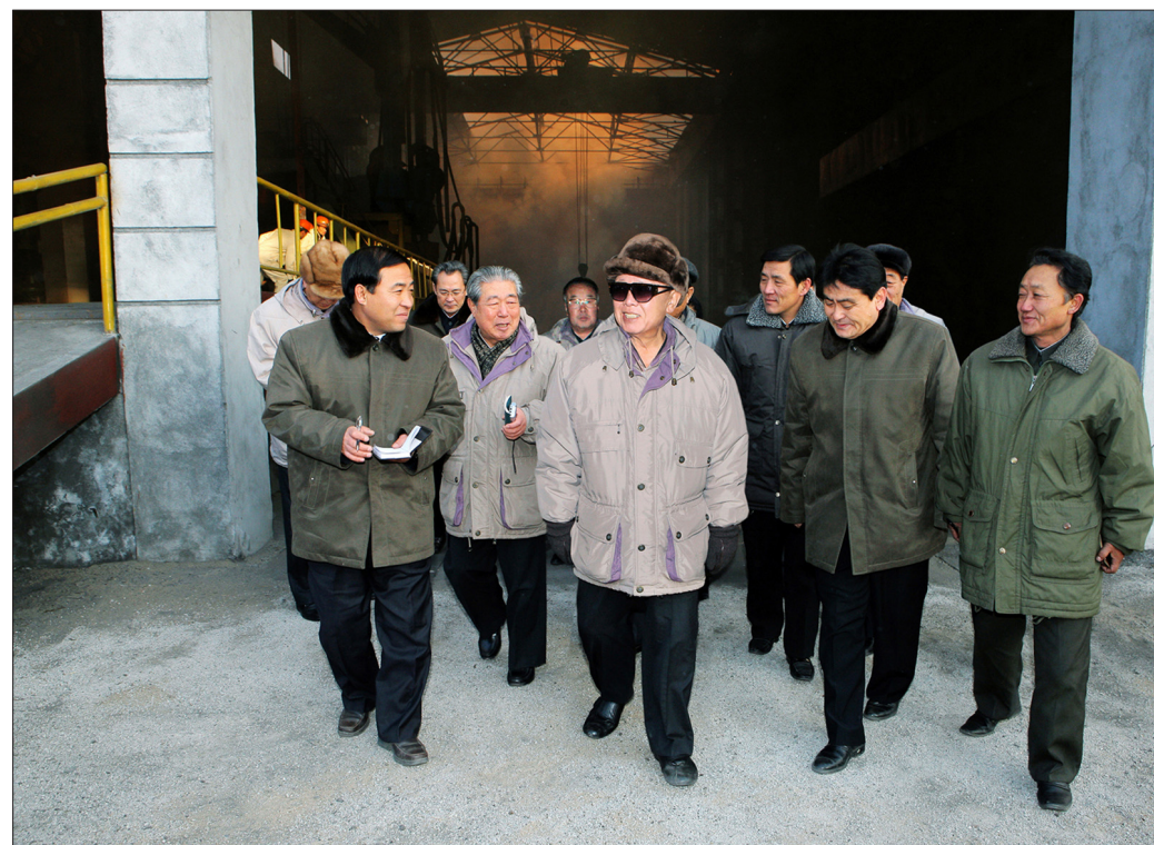
Chairman Kim Jong Il inspects the Songjin Steel Complex in December 2009.