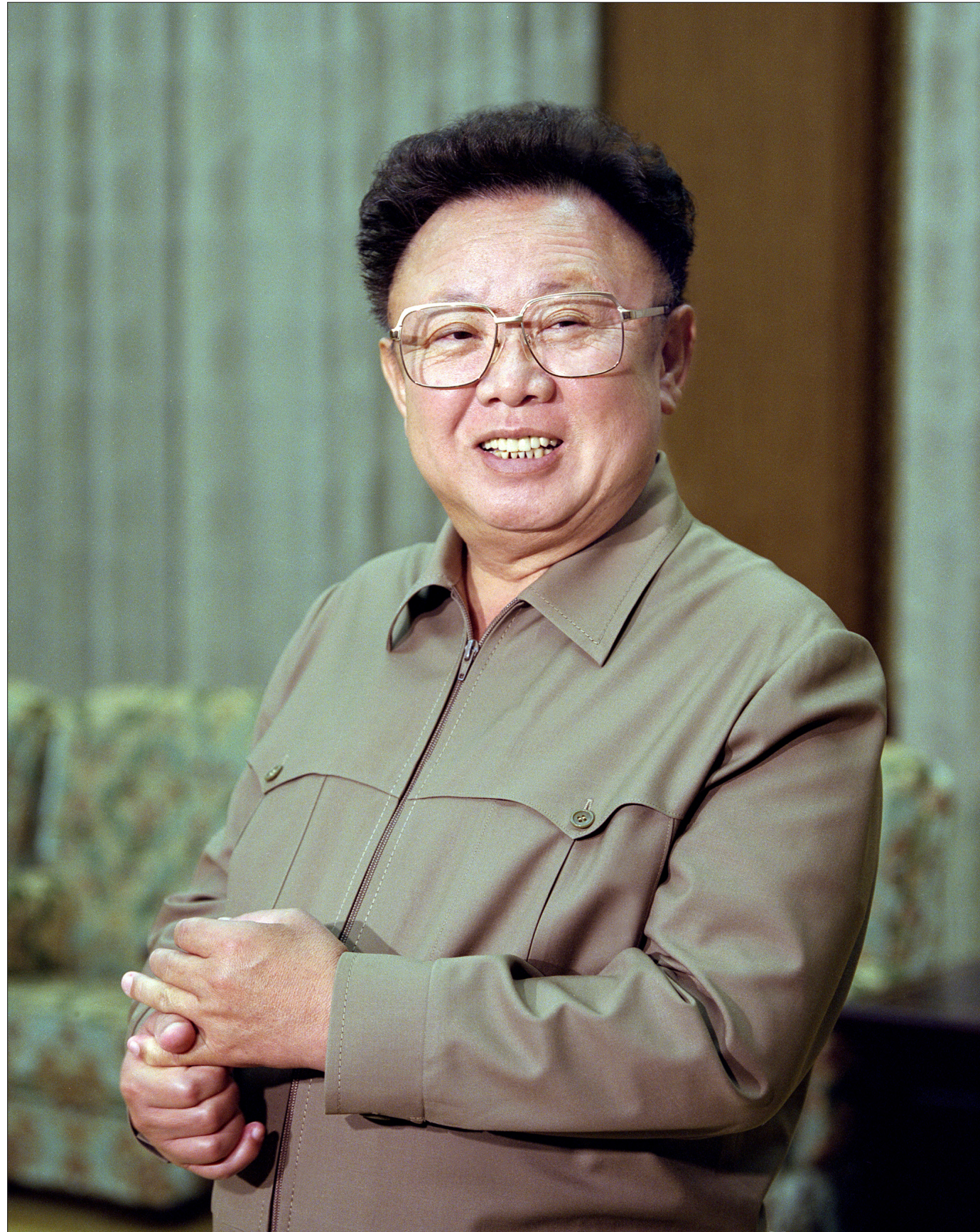
Chairman Kim Jong Il, great leader of the Korean people.

His energetic guidance brought about great changes across the country as he mapped out bold plans for operations and found ways to work miracles at construction sites of industrial establishments and elsewhere.