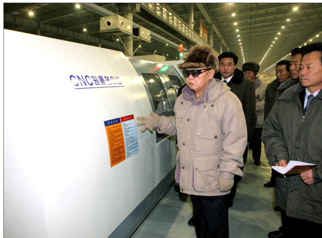
Seeing new types of CNC machine tools in December 2010.