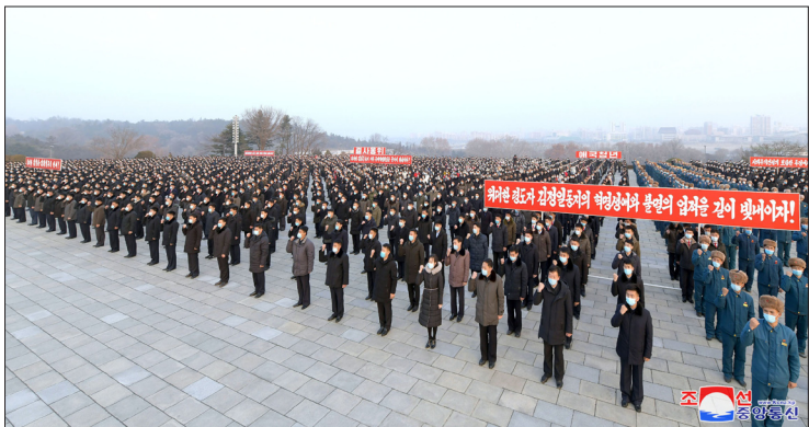
Different events are held to mark the anniversary of the demise of Chairman Kim Jong Il.