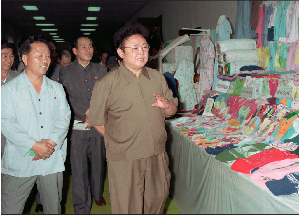
Kim Jong Il looks round the light industry goods exhibition in August 1984.