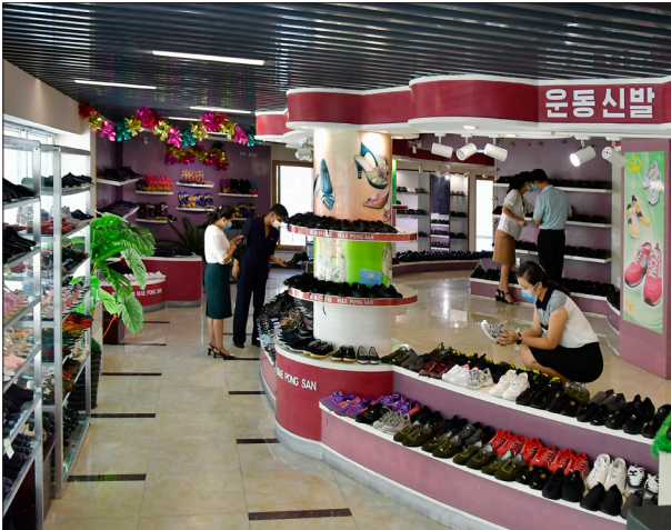
HONG KWANG NAM / THE PYONGYANG TIMES