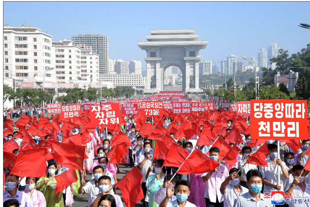
Participants in a mass demonstration march towards Kim Il Sung Square holding red flags, slogan boards and placards.