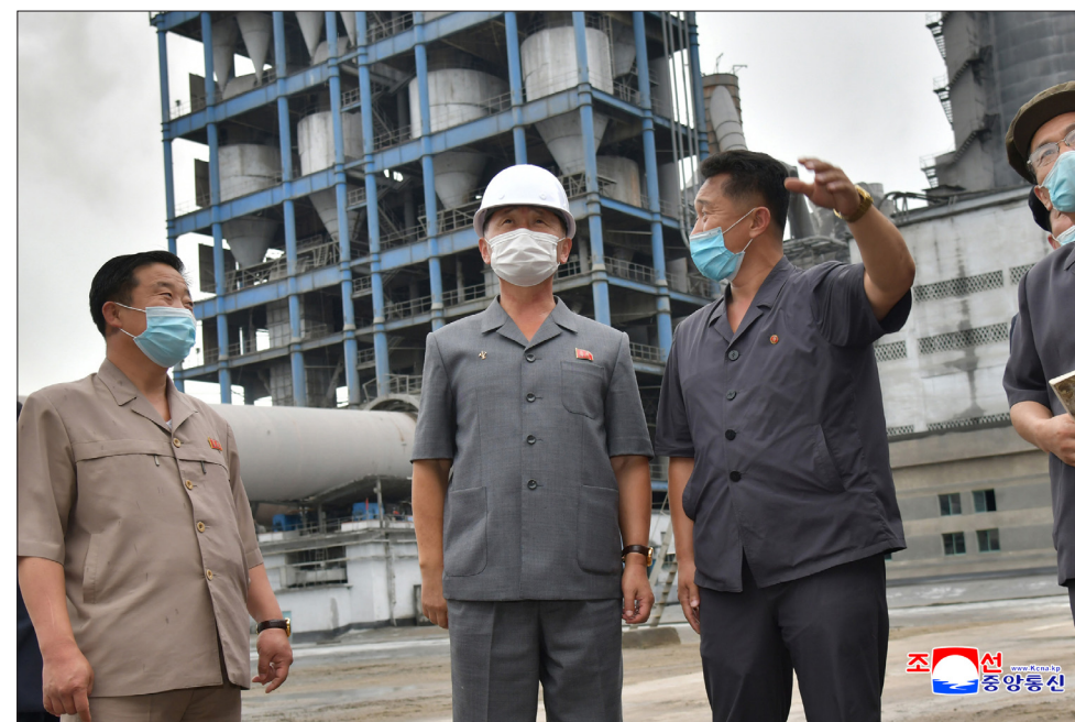
Premier Kim Tok Hun (second from left) looks round the Sunchon Cement Complex.