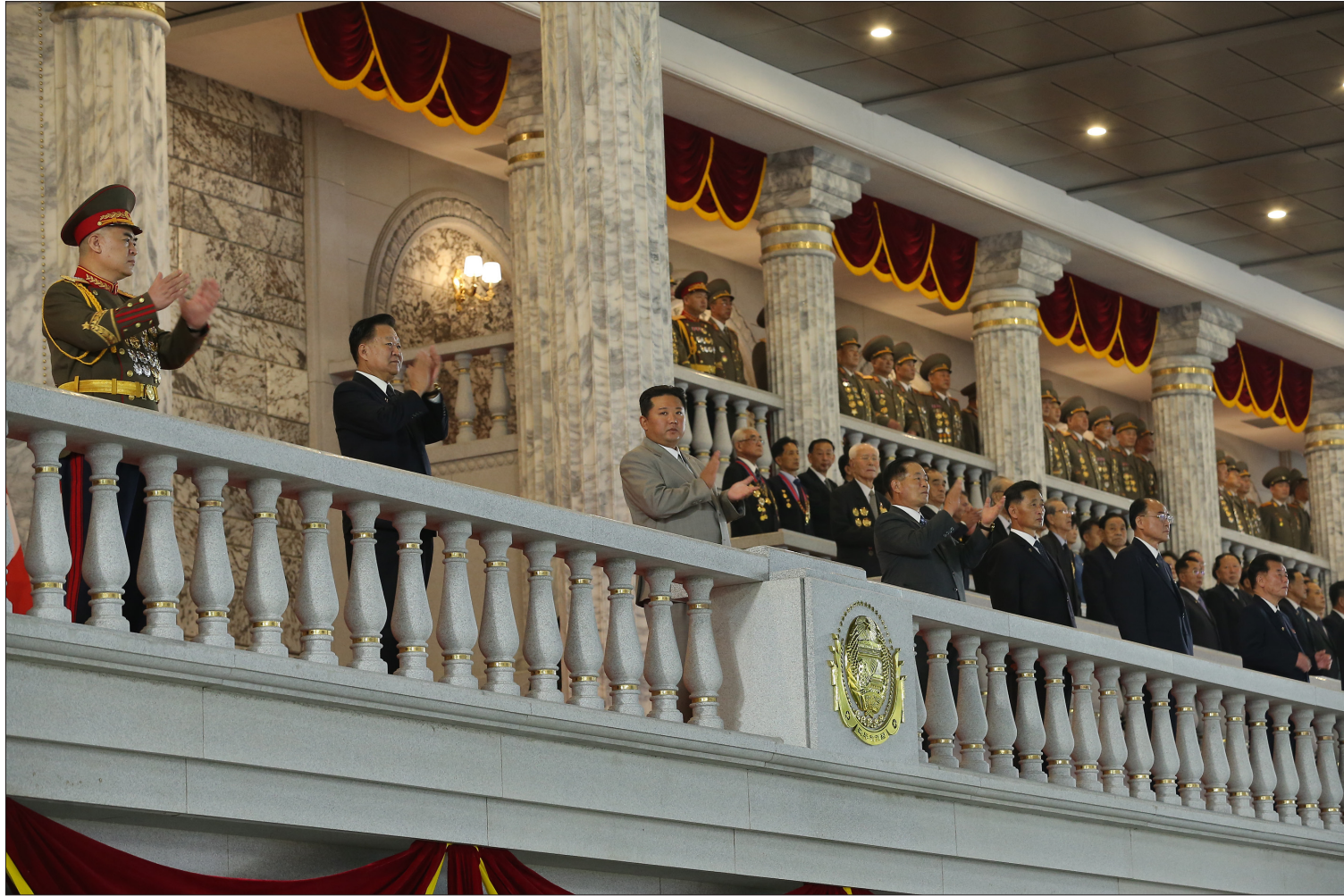
FROM PAGE 1

Ryong Hae, member of the Presidium of the Political Bureau of the WPK Central Committee, first vice-president of the State Affairs Commission of the DPRK and chairman of the Standing Committee of the Supreme People's Assembly, Jo Yong Won, member of the Presidium of the Political Bureau and secretary for Organizational Affairs of the WPK Central Committee, Kim Tok Hun, member of the Presidium of the Political Bureau of the WPK Central Committee and premier of the DPRK Cabinet, and Pak Jong Chon, member of the Presidium of the Political Bureau and secretary of the WPK Central Committee.