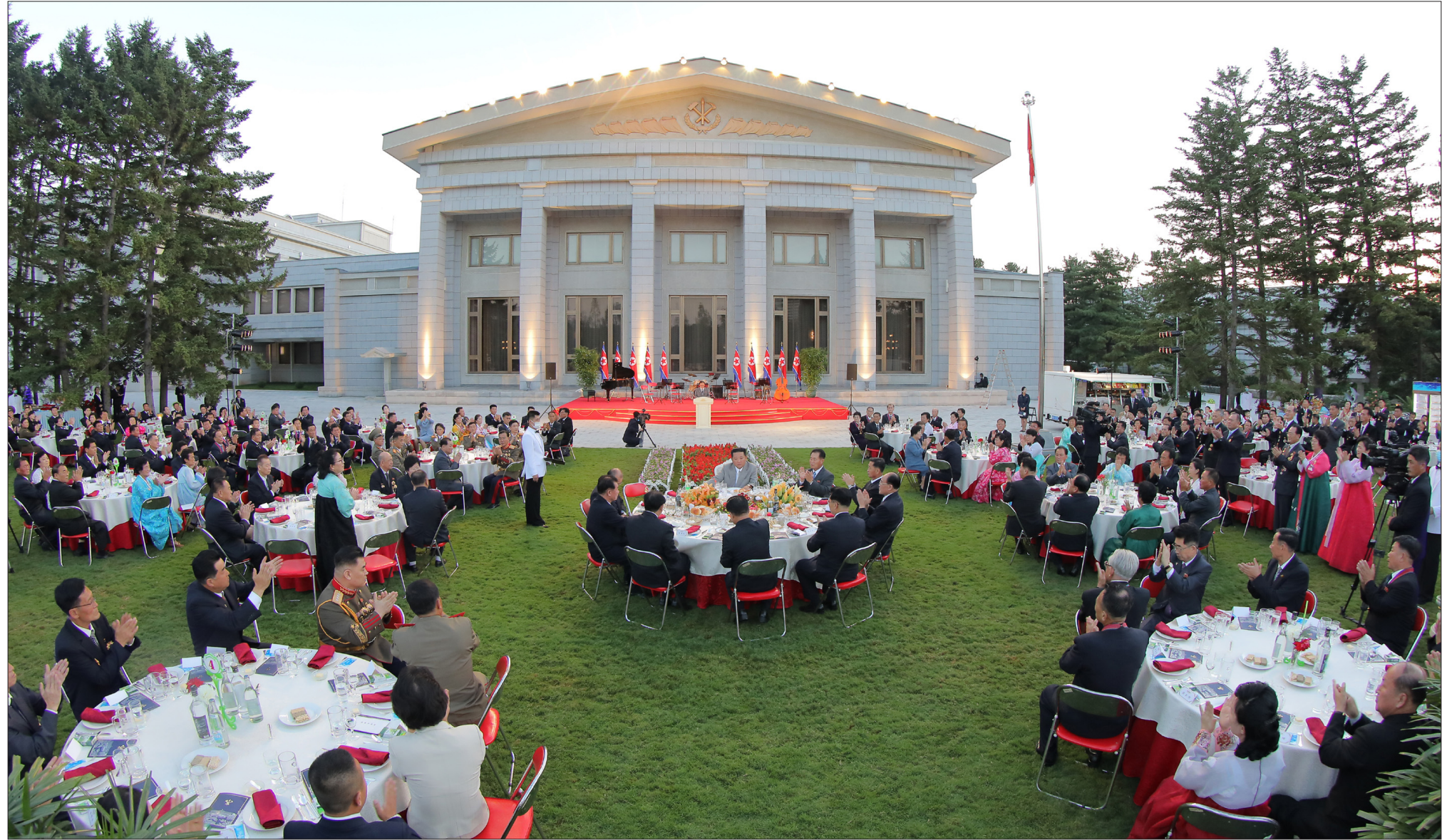
FROM PAGE 7

though they did what they ought to do for the motherland.