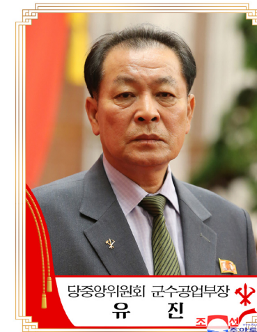
Yu Jin, director of the Department of the Munitions Industry of the WPK Central Committee