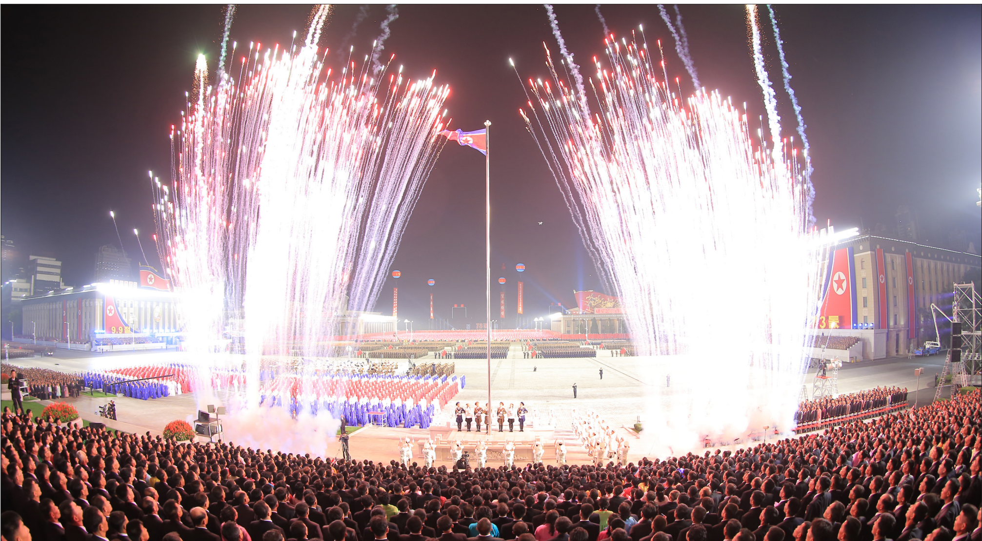
FROM PAGE 2