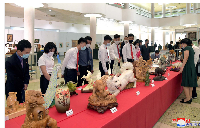
Visitors look round exhibits at he second national sculpture and craftwork festival that opened at the Okryu Exhibition Hall on September 7 and runs through this month. Among the exhibits are pieces which were highly appreciated at local shows.

The inaugural ceremony was held on Tuesday by Jon Hak Chol, minister of Coal Industry, in attendance.