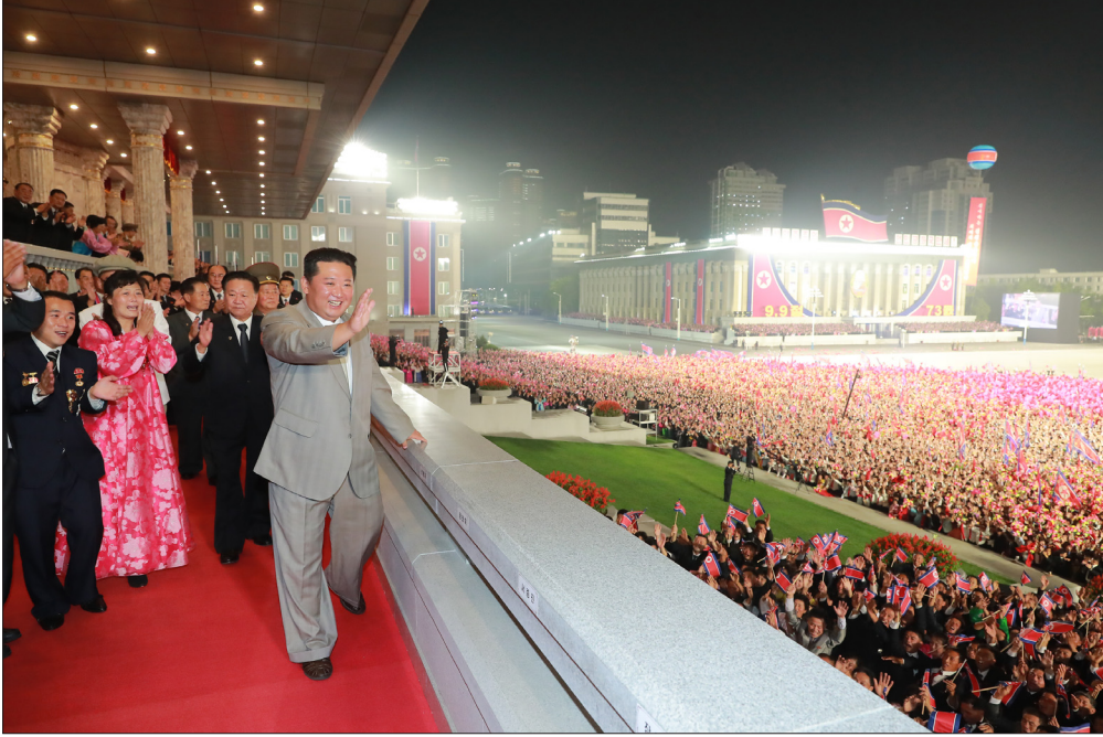
FROM PAGE 4

force column of the Public Security Forces.