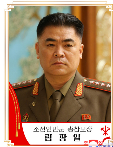
Rim Kwang Il, chief of the General Staff of the Korean People's Army