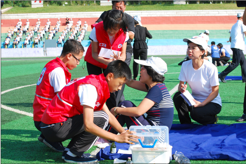
Young Koreans attend the First Aid Event of Red Cross Youth in 2017.

The author is health officer of the DPRK RCS