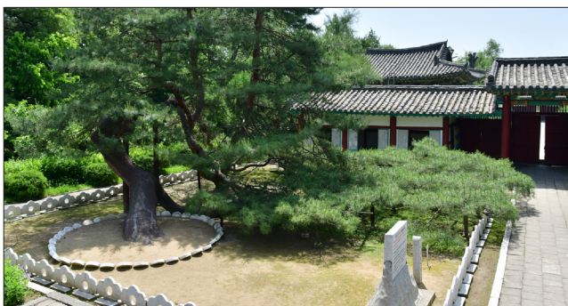
Pinus densiflora form in Hamhung.

are lots of twigs covered with green needles at the tips, forming a beautiful tray-shaped crown which is 13.8 metres in diameter.