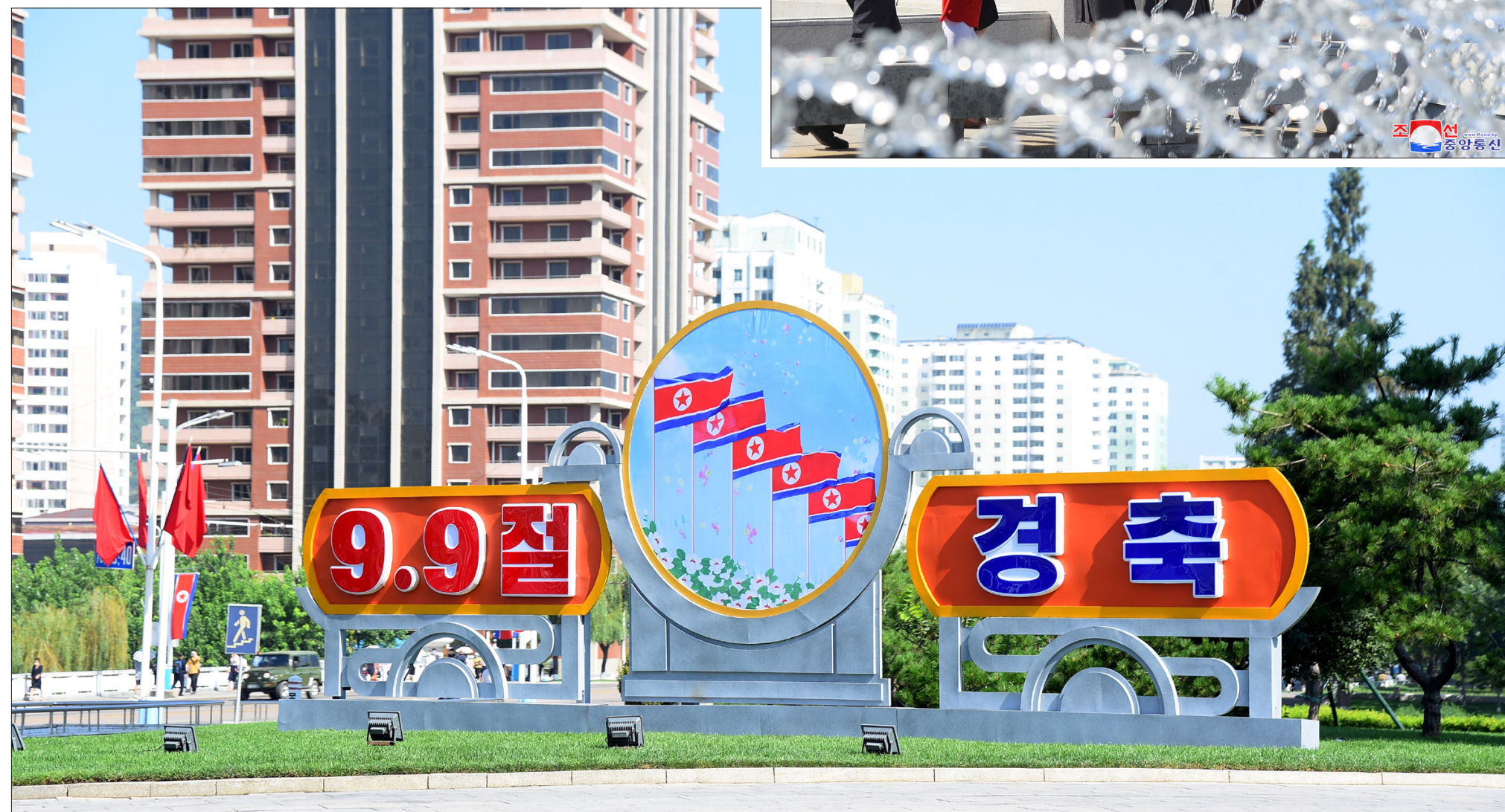
A range of events, performances, social gatherings and visits, are held to mark the DPRK's 73rd anniversary in Pyongyang. A big poster is seen above.