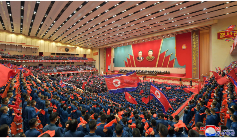
Young people who volunteered to work in the difficult and challenging sectors vow to demonstrate the mettle of the socialist patriotic youth after receiving the letter of congratulation from General Secretary Kim Jong Un.