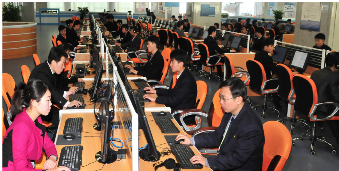
The file photo shows working people browsing information at the e-library of the Sci-Tech Complex in 2018.

Among those who enrol and study in the online courses of the Sci-Tech Complex, the Grand People's Study House and other universities are not only technicians but also leading officials of factories and enterprises and housewives.