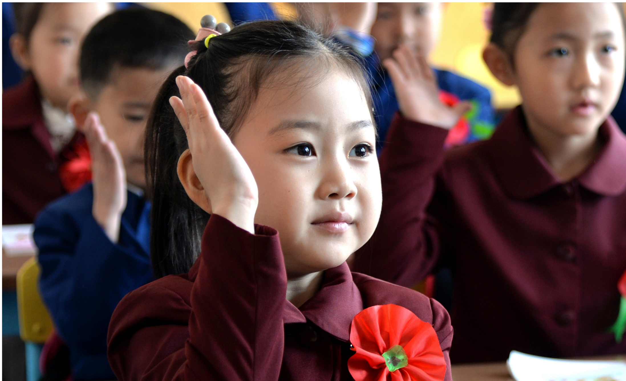
Pupils at Kim Song Ju Primary School attend the first lesson for the 2018 new school year. The universal 12-year compulsory education was taken into force across the country in 2017.