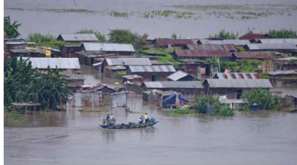
Houses partly submerged by flash flood in India.