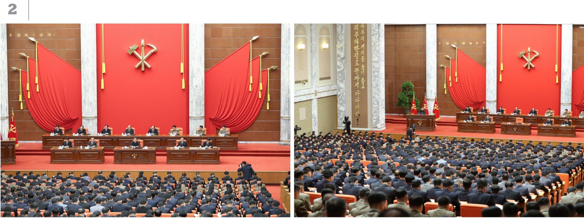
FROM PAGE 1

conservation ever since the country’s liberation and has been pressing ahead with the work as a more important political task in recent years, he stressed that land management means just the economic construction and the essential condition for the safety of the people and state development in our country with lots of mountains and rivers and long coastlines.