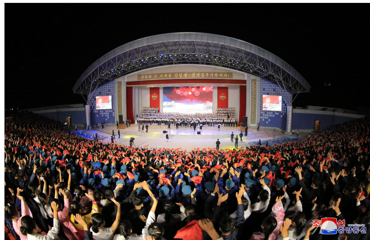
The participants in Youth Day celebrations have a good time enjoying art performances and riding amusement facilities.