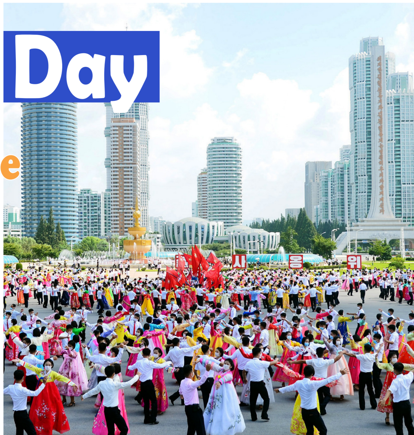
Young people hold a dance party on August 28 at the plaza in front of the April 25 House of Culture in Pyongyang as part of Youth Day celebrations.

Singing the song of devotedly defending the Party Central Committee in chorus and waving red flags vigorously, all the participants were flooded with the zeal of loyalty with which to repay with miracles and feats the great benevolence of the respected General Secretary, who sent a letter of congratulation of love and trust to the youth and ensured that the youth could lead the most worthwhile life.