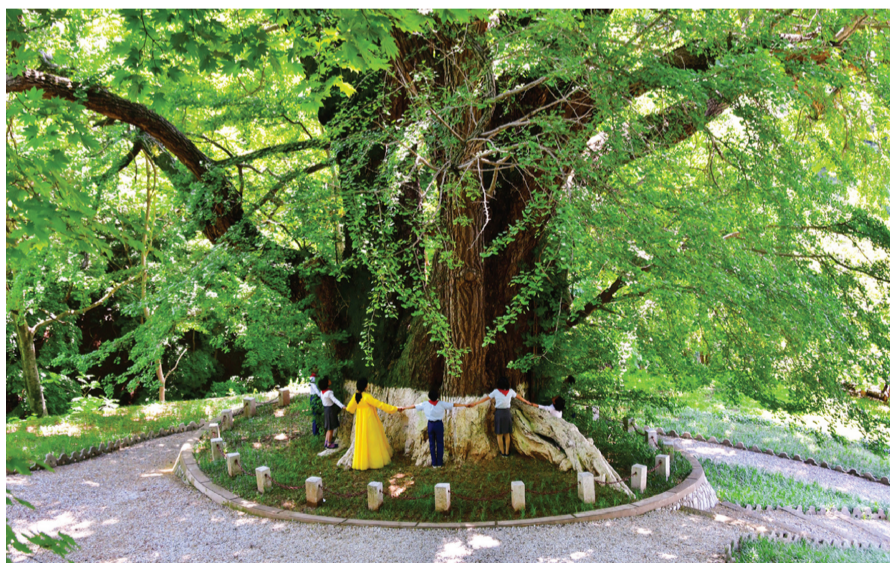
Several people put their open arms together around a 15-metre-round ginkgo tree that is 2 140 years old.