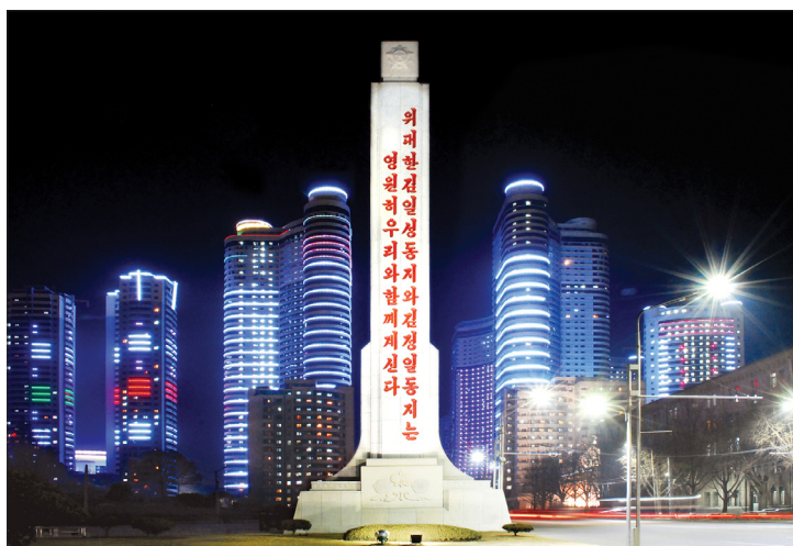
The tower to the immortality of the great leaders reads: "The great Comrades Kim Il Sung and Kim Jong Il will always be with us!"