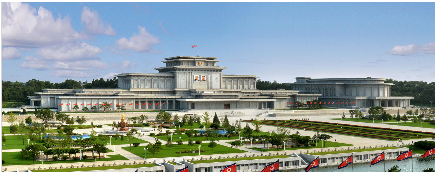
The Kumsusan Palace of the Sun where President Kim Il Sung and Chairman Kim Jong Il are preserved in their lifetime appearance.

The special report fully reflected the ardent desire of the Korean people for holding the Chairman, who devoted his whole life for the good of the people, in high esteem forever and their will to translate all his lifetime intentions into reality