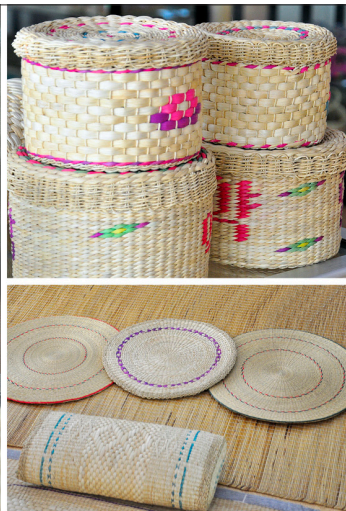
Different grasswork products from the Sinuiju City Grasswork Production Cooperative.

The Sinuiju City Grasswork Production Cooperative in North Phyongan Province is a small unit with only dozens of employees.