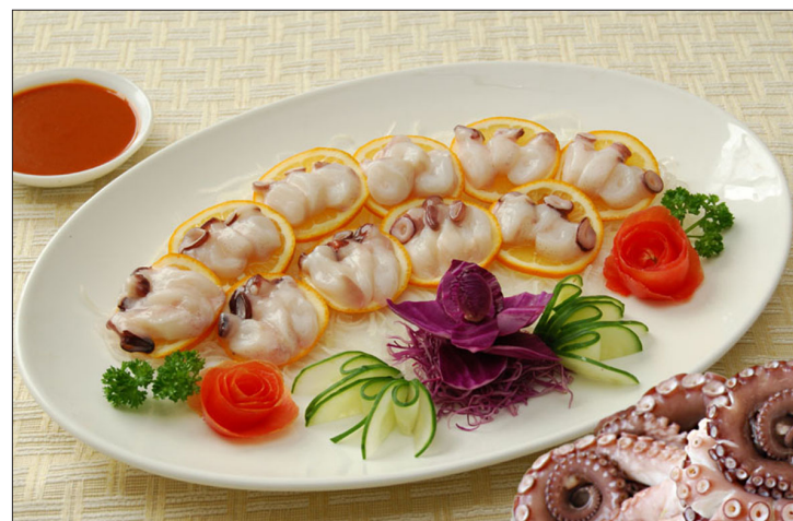
Octopus dish, specialty of Kangwon Province.