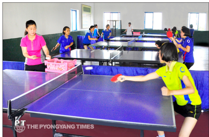
Students train table-tennis at Pothonggang District Juvenile Sports School.