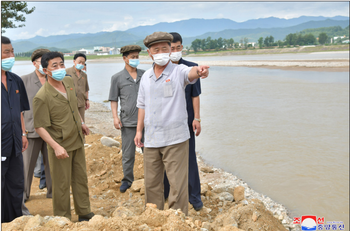
Premier Kim Tok Hun (second from right) acquaints himself with the recovery work in flood-hit Yonggwang County.

Premier Kim Tok Hun, who is member of the Presidium of the Political Bureau of the Central Committee of the Workers' Party of Korea, inspected the flood-stricken areas in South Hamgyong Province to learn about the relief operation. Looking round the afflicted areas in Yonggwang, Sinhung and Hongwon counties and Tanchon City, he gave pep talks to the service personnel of the Korean People's Army and people in the province who are fully displaying the