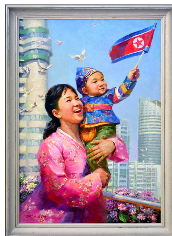
Oil painting “At the construction site of 10 000 flats in Pyongyang” (left) and oil painting “Holiday in the morning” (right).