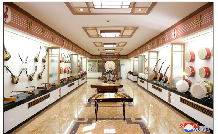
Traditional musical instruments are displayed at the Pyongyang National Musical Instrument Factory.

Since ancient times the Koreans had sung songs reflecting their desires and sentiments and in that course they created and developed national music.