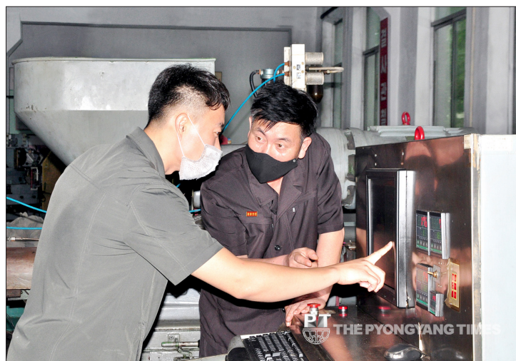
Two technicians work on a new automatic control system at the Pothonggang Footwear Factory.