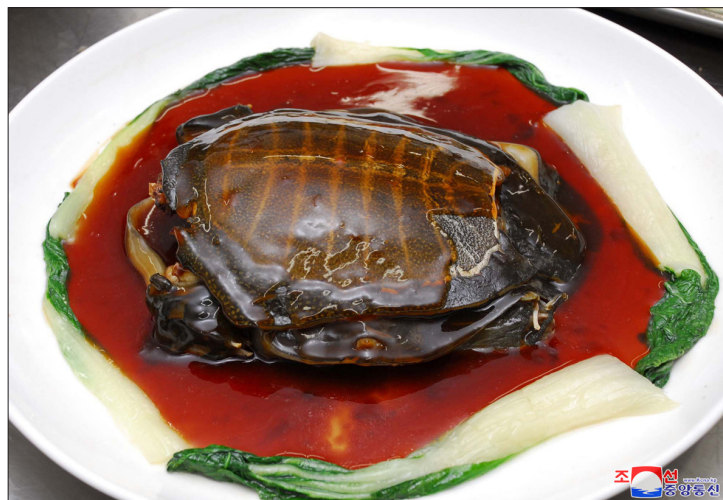
Full steamed terrapin registered as a famous dish.