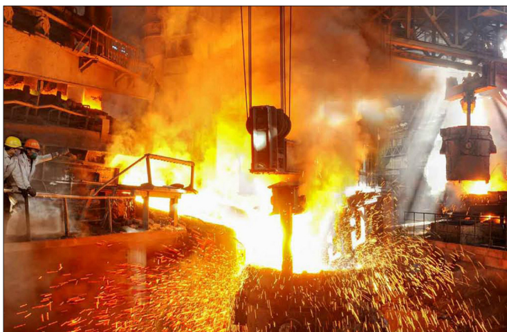
Molten iron is turned out in the Chollima Steel Complex.

The Anju Pump Factory and Kyongsong Insulator Factory introduced research findings that are conducive to improving