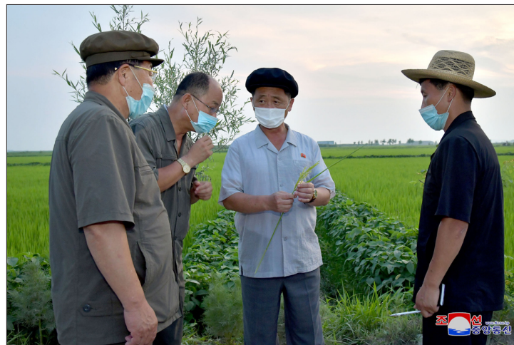
Premier Kim Tok Hun (second from right) inquires about farming in Tongnim Cooperative Farm, Mundok County.

Premier Kim Tok Hun, who is also member of the Presidium of the Political Bureau of the Central Committee of the Workers' Party of Korea, inspected different sectors of South Phyongan Province.