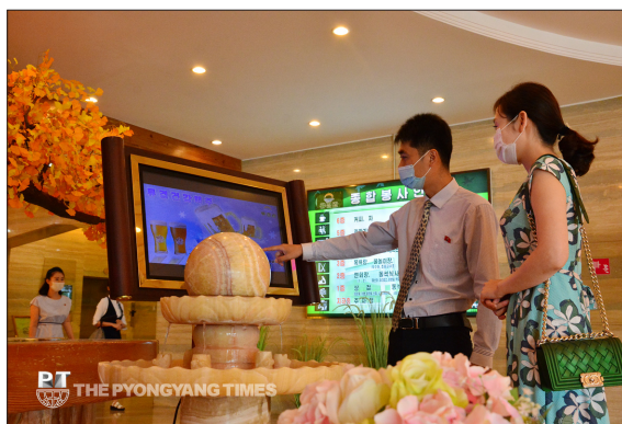
A cook serves clients griddle grill at the Ryugyong Service Complex (left). A couple choose beer on the screen (right).