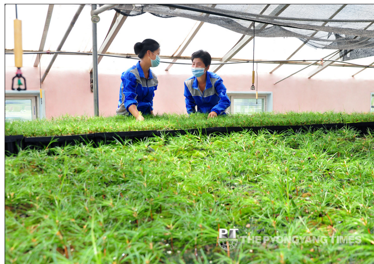
Saplings of Sangwon poplar are cultivated in outdoor and indoor facilities in Jungsan County, South Phyongan Province.