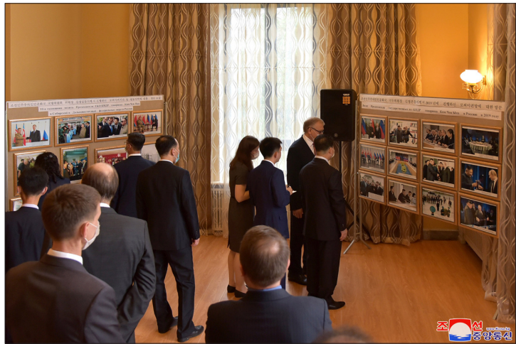
A photo exhibition is held in the Russian embassy in Pyongyang to mark the 20th anniversary of Chairman Kim Jong Il's visit to Russia and the tenth anniversary of his visit to Russia's Siberian and Far Eastern regions.

A photo exhibition was held at the Russian embassy in Pyongyang on August 3 to mark the 20th anniversary of Chairman Kim Jong Il's historic visit to Russia and the 10th anniversary of his visit to the Siberian and Far Eastern regions.