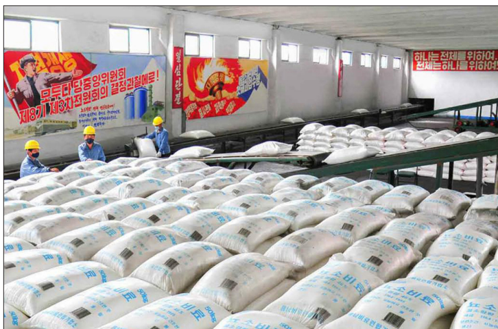
Packed fertilizer is transported by conveyor belt at the Hungnam Fertilizer Complex.