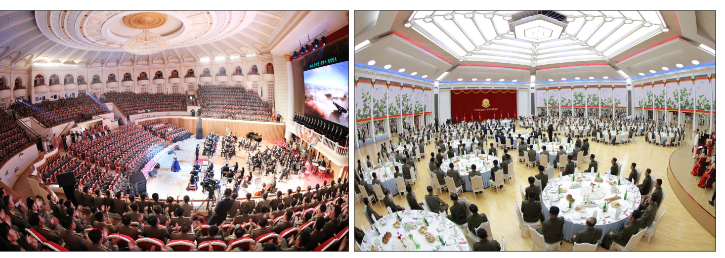
The Band of the State Affairs Commission gives a performance at the Samjiyon Theatre on July 29 and a reception is arranged for the participants in the first workshop of the commanders and political officers of the Korean People's Army on July 28.