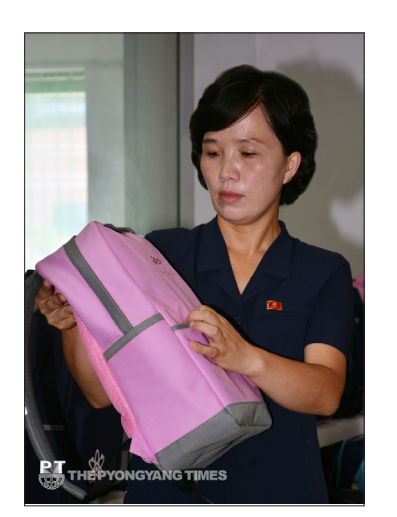
Factory and became a deputy to the Supreme People's Assembly five years later.

She was appointed as the manager of the Pyongyang Bag