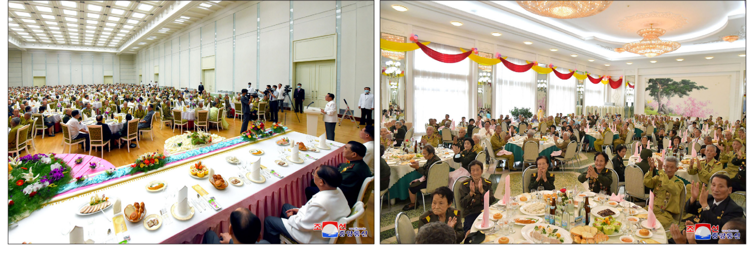
Banquets are given at the People's Palace of Culture, Okryu and Chongnyu restaurants, Pyongyang Noodles House and elsewhere on July 27 for the participants in the Seventh National Conference of War Veterans.