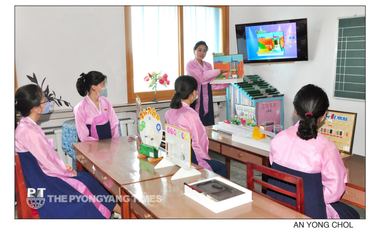
Teachers brainstorm to apply new teaching methods at Sungni Primary School in Rangnang District.

Songwon and other counties and cities in Jagang Province demolished old school buildings in rural areas and rebuilt them to the level of model schools to provide students with better study conditions and environment like those of schools in urban areas.