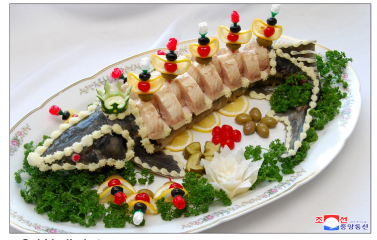
Cold boiled sturgeon.