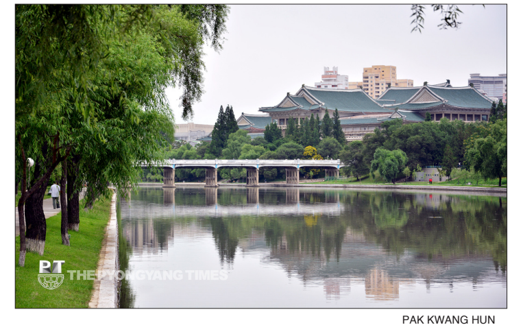
Willow trees droop their branches over the Pothong River in midsummer.