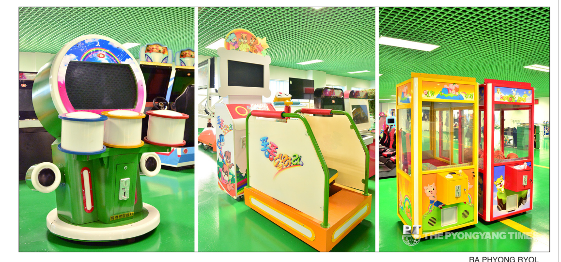
Amusement facilities produced by the Mokran Kwangmyong Technology Company.