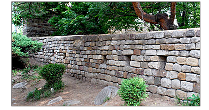
A section of the Walled City of Pyongyang.