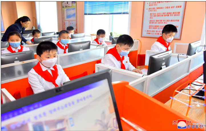
Pupils at Ryomyong Primary School in Taesong District, Pyongyang, learn how to use computers with the help of their teacher.