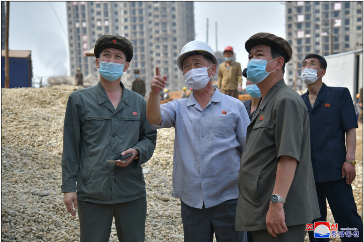
Premier Kim Tok Hun (centre) inspects a construction site of 10 000 flats in Pyongyang.

Premier Kim Tok Hun, who is also member of the Presidium of the Political Bureau of the Central Committee of the Workers' Party of Korea, inspected the construction sites of 10 000 flats in Pyongyang. Looking round the construction sites, he urged all units to meet their operation schedules according to the projects without fail, increase the operation rate of construction equipment to the maximum and thoroughly ensure the quality of construction. The field consultative meeting discussed the issues arising in giving top priority to the supply