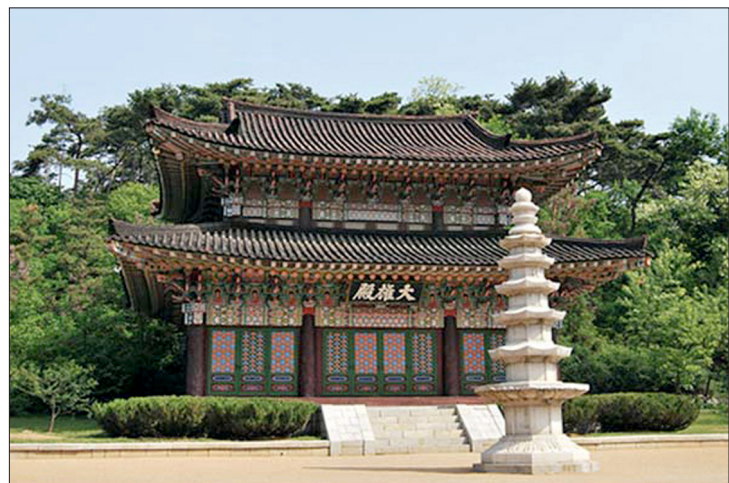
The Taeung Hall of the Kwangbop Temple.