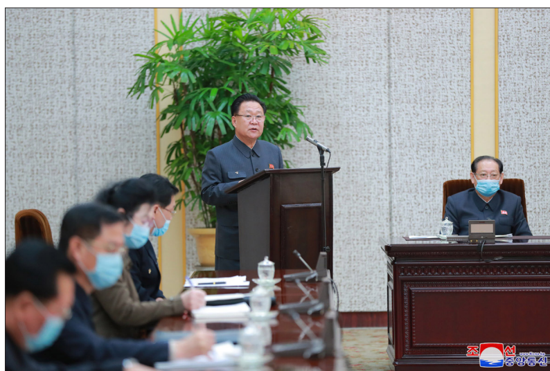
The 13th Plenary Meeting of the Standing Committee of the 14th Supreme People's Assembly of the DPRK takes place at the Mansudae Assembly Hall on March 3.

The 13th Plenary Meeting of the Standing Committee of the 14th Supreme People's Assembly of the DPRK was held at the Mansudae Assembly Hall in Pyongyang on Wednesday.