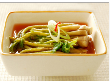
Kimchi made of aralia shoots.