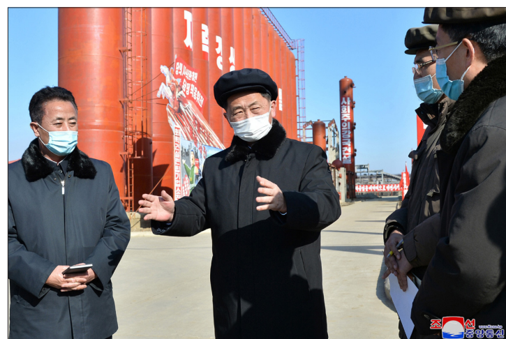
Premier Kim Tok Hun (second from left) discusses with officials to establish the C1 chemical industry.