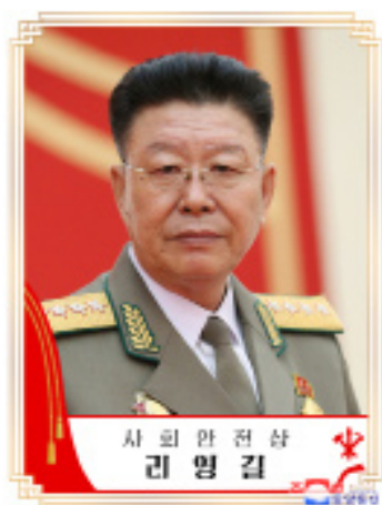
Ri Yang Gil, minister of Public Security