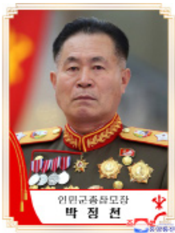
Pak Jong Chul, chief of the General Staff of the Korean People's Army