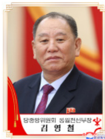
Kim Yang Chol, director of the United Front Work Department of the Party Central Committee