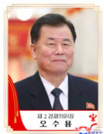
O Su Yong, chairman of the Commission of the Second Economy