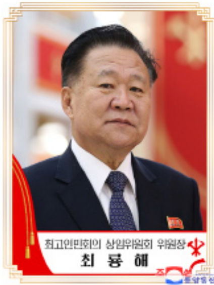
Choe Ryong Hae, president of the Presidium of the Supreme People's Assembly