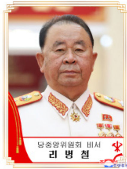
Ri Pyong Chol, secretary of the Party Central Committee