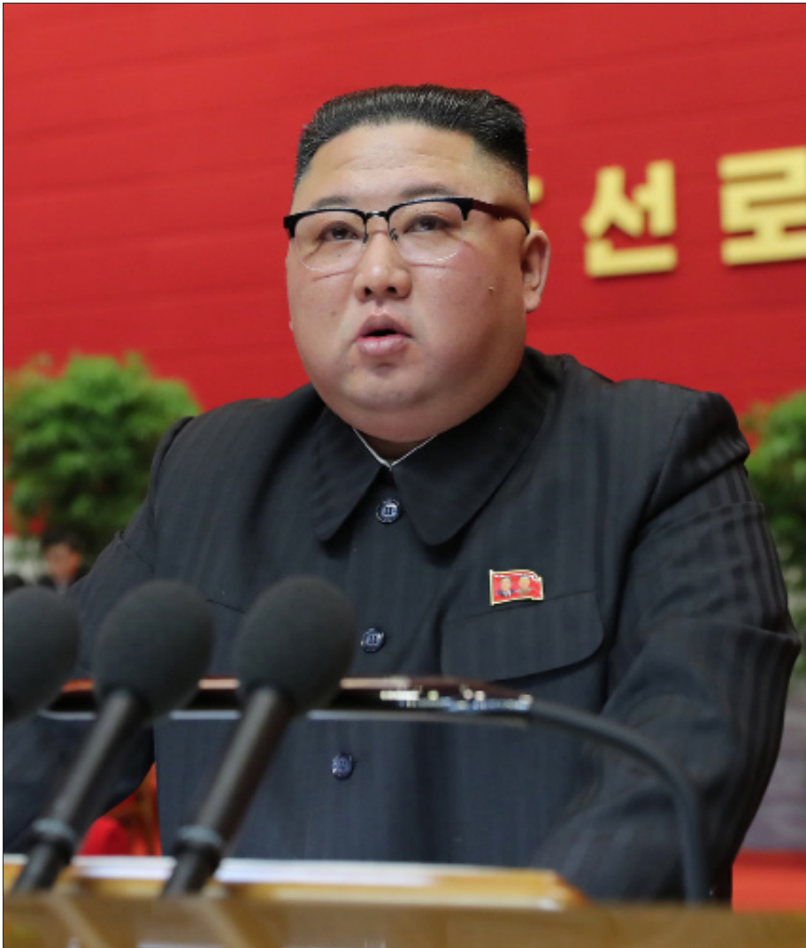
General Secretary Kim Jong Un delivered a closing address at the Eighth Congress of the Workers' Party of Korea on Tuesday. The following is the full text: