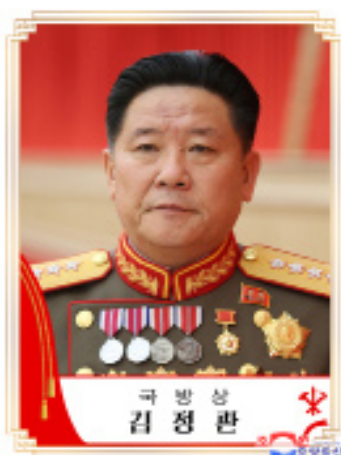
Kim Jong Gwan, minister of Defense