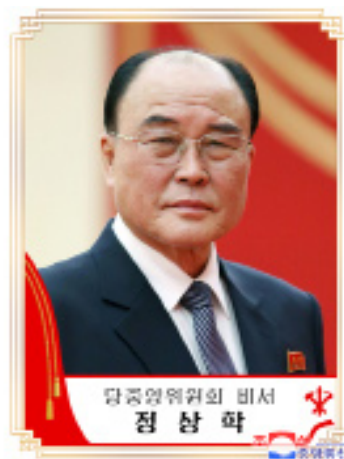
Jong Song Hak, secretary of the Party Central Committee