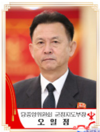
O Il Jong, director of the Department of Political Leadership over Military Affairs of the Party Central Committee