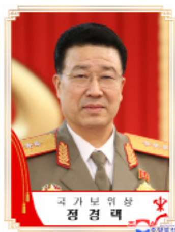
Jong Kyong Thae, minister of State Security