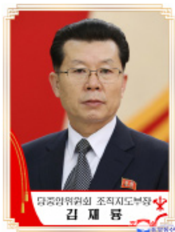
Kim Jai Ryong, director of the Organizational Leadership Department of the Party Central Committee