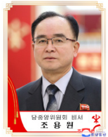
Jo Yong Won, secretary of the Party Central Committee