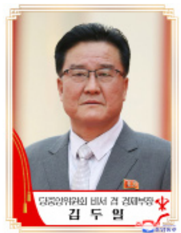
Kim Tu Il, secretary of the Party Central Committee and director of its Department of Economic Affairs