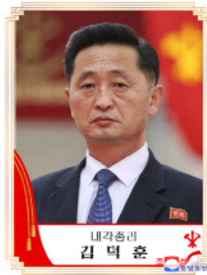
Kim Tok Hui, premier of the Cabinet