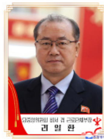
Ri Il Hwan, secretary of the Party Central Committee and director of its Department of Working People's Organizations