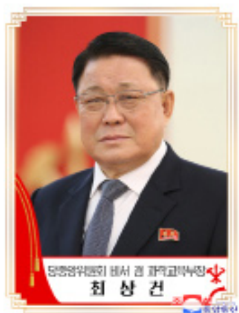
Choe Sang Gon, secretary of the Party Central Committee and director of its Department of Science and Education