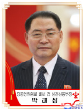
Pak Thae Song, secretary of the Party Central Committee and director of its Information and Publicity Department